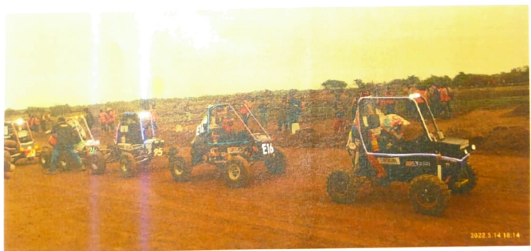
Photograph 4: E- 16 on FLAT DIRT RACE