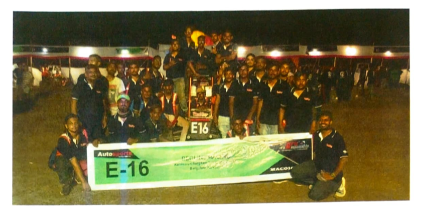
Photograph 8: Team after completing all the events