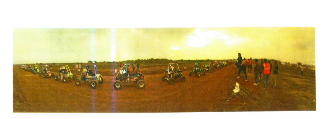
Photograph 5: E- 16 on Line up in NIGHT ENDRANCE RACE