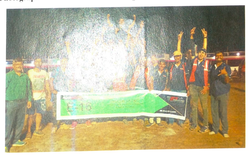
Photograph 10: Team cheering after winning