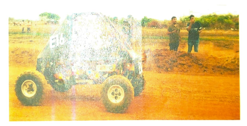
Photograph 7: E- 16 on Final ENDURANCE RACE