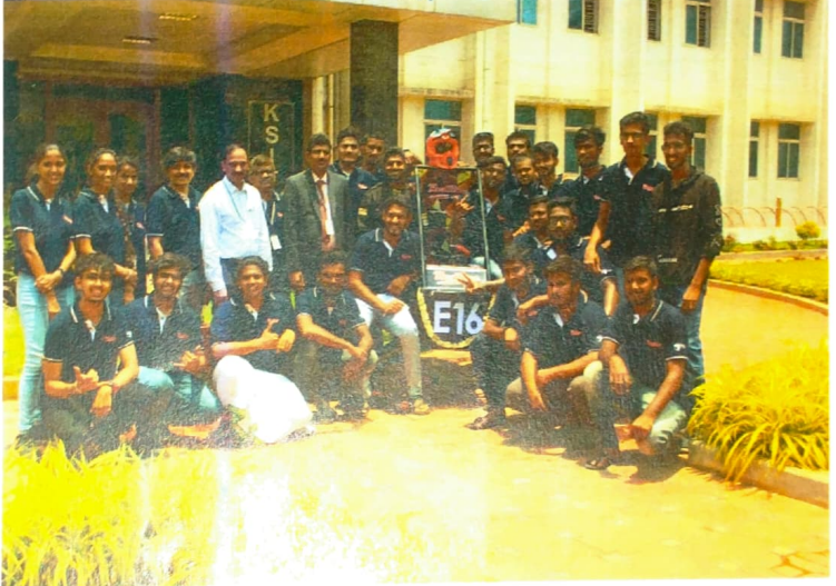
Photography 3: Team with HOD sir and Principal sir