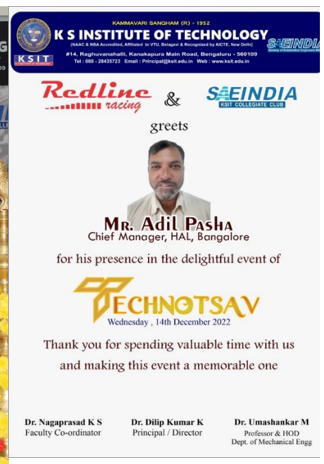
Fig 7: Memento for Chief Guest