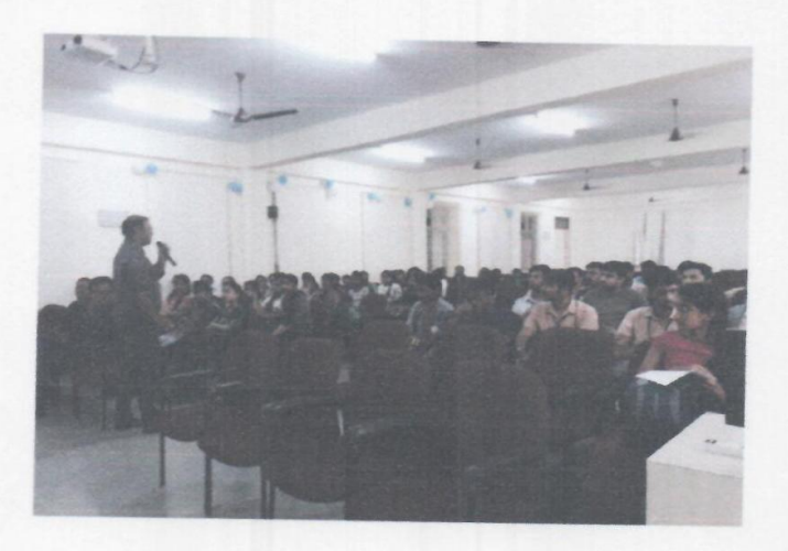
2. Targeted Students

Speaker started the seminar by briefing about wide range of programmes offered not only for national and state-level entrance exams like the CAT, MAT, JEE MAIN, and JEE ADVANCED but also for international exams like GMAT, GRE, IELTS and TOEFL. CAT is the superset of all the other exams. Speaker taught the students some of the shortcut methods to solve aptitude problems and save their time during examination.