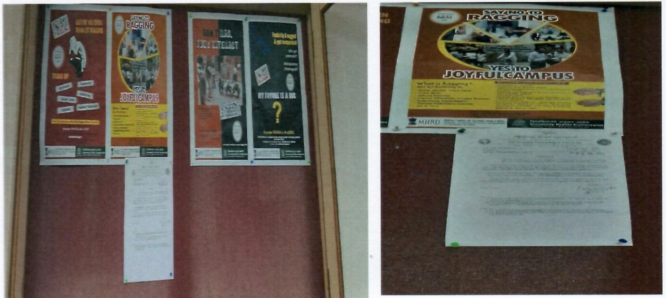
Fig 1. Ragging related Posters, Circular related punishments for Ragging & Harassment

https://ksit.ac.in/disciplinary_measures.html#notice