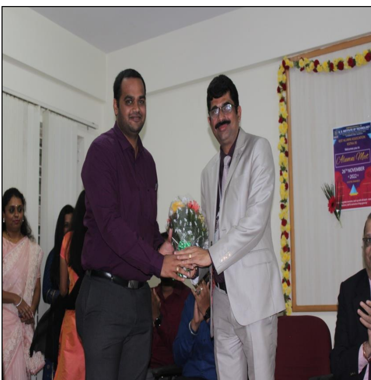
Then the Guests addressed the gathering. They shared their successful journey and also refreshed their memories of the college days in KSIT.