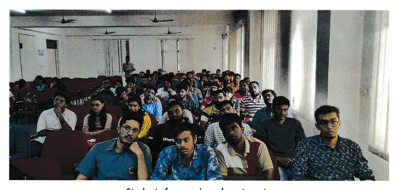
Students from various departments