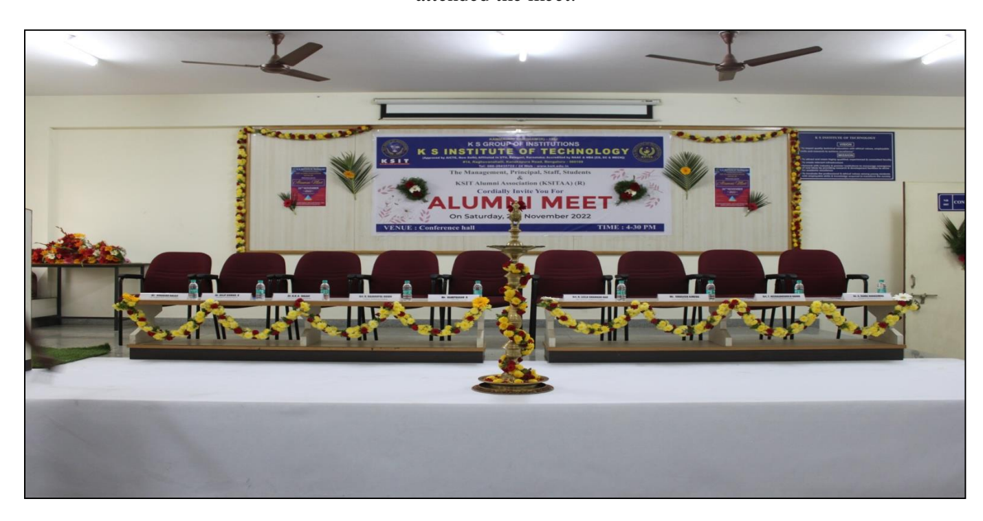
The Registrations for the Alumni Meet started at 04.30 pm

The Alumni Meet was organized on 26<sup>th</sup> November 2022 in KSIT conference hall at 04:30 pm & 182 Alumni have attended the meet.