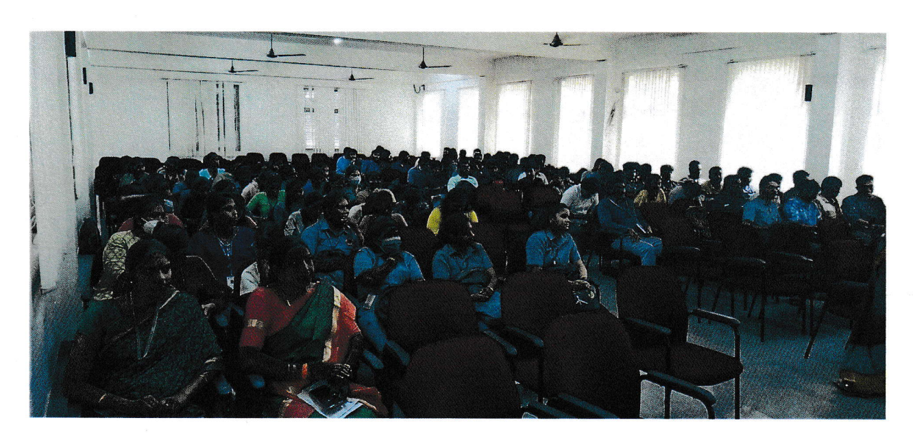
Students from various departments