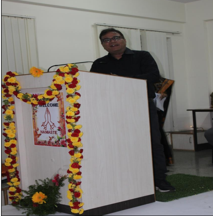
Few of the Alumni present have shared their views and memories at KSIT during their stay.