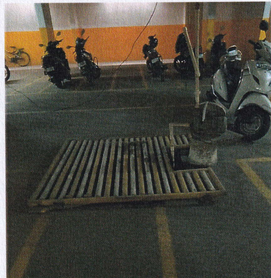
3481/2, 80 Feet Rd, near आर्यभट्ट बैंक, 4th H block, Raghuvanahalli, Subramanyapura, Bengaluru, Karnataka 560062, India

Latitude 12.8805616° Longitude 77.5438496° Local 12:30:33 PM Altitude 880 m GMT 07:00:33 AM Monday, 31.07.2023