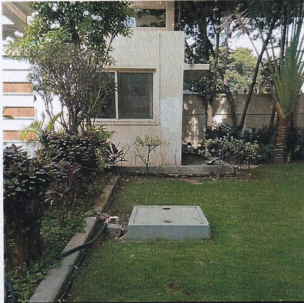
VGHW+M3H, 80 Feet Rd, Raghuvanahalli, Bangalore City Municipal Corporation Layout, Bengaluru, Karnataka 560062, India

Latitude 12.878955° Longitude 77.54516833333334° Local 02:36:35 PM Altitude 895 m GMT 09:06:35 AM Monday, 31.07.2023