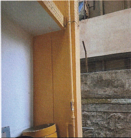
14, Kanakapura Rd, 4th H block, Raghuvanahalli, Bangalore City Municipal Corporation Layout, Bengaluru, Karnataka 560062, India

Latitude 12.879643333333336° Local 12:21:24 PM GMT 06:51:24 AM