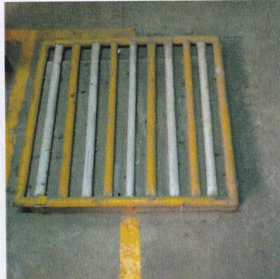
No 3490, 2nd Floor 4th H Blk, 80ft Rd, Banskankari, near KSIT Engineering College, Raghuvanahalli, Bangalore City Municipal Corporation Layout, Bengaluru, Karnataka 560062, India

Latitude 12.878955° Longitude 77.54516833333334° Local 02:36:35 PM Altitude 895 m GMT 09:06:35 AM Monday, 31.07.2023