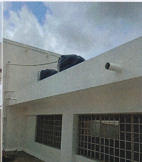
14, Kanakapura Rd, Raghuvanahalli, Bangalore City Municipal Corporation Layout, Bengaluru, Karnataka 560062, India