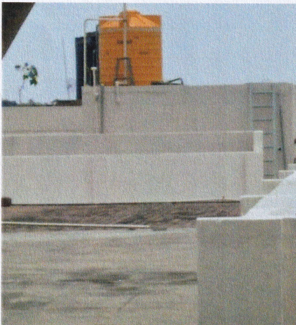
14, Kanakapura Rd, Raghuvanahalli, Bangalore City Municipal Corporation Layout, Bengaluru, Karnataka 560062, India