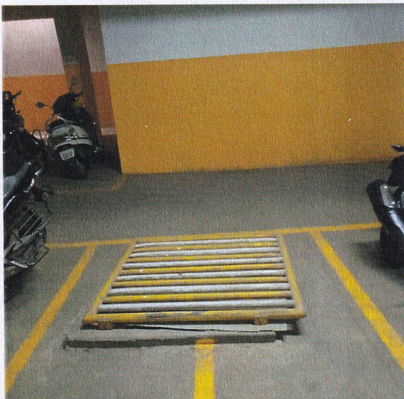
80 feet road, off Kanakapura Road, behind KS Polytechnic College, 4th H block, Raghuvanahalli, Subramanyapura, Bengaluru, Karnataka 560062, India

Latitude 12.8793358° Longitude 77.5447116° Local 12:29:45 PM Altitude 886 m GMT 06:59:45 AM Monday, 31.07.2023