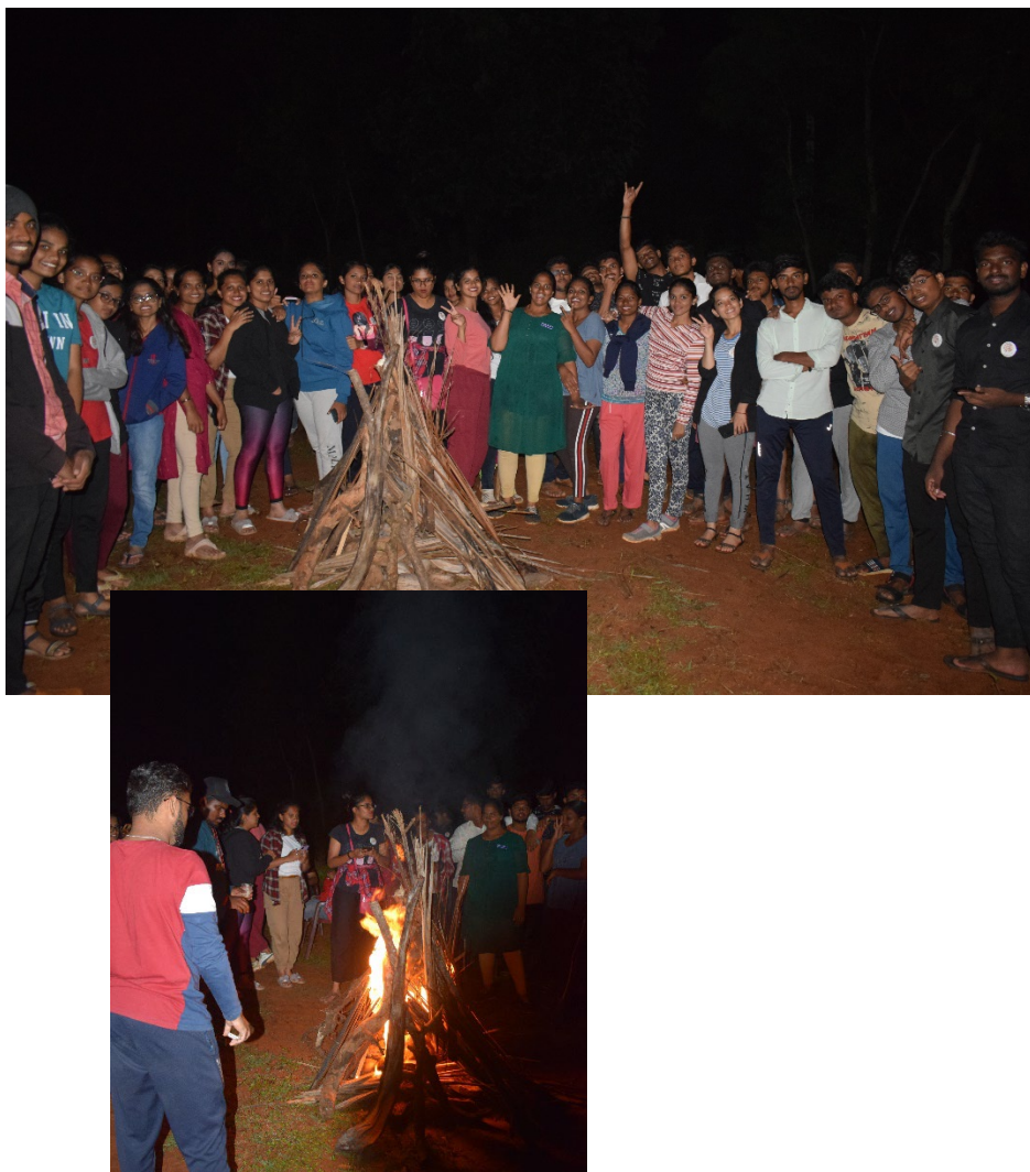
Photos of Campfire