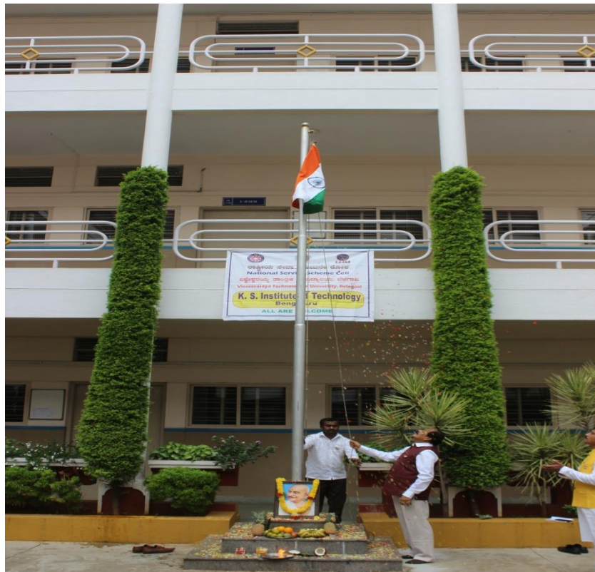
Flag hoisting by the President