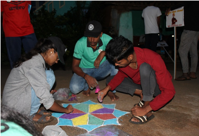
Preparations for flag hoisting