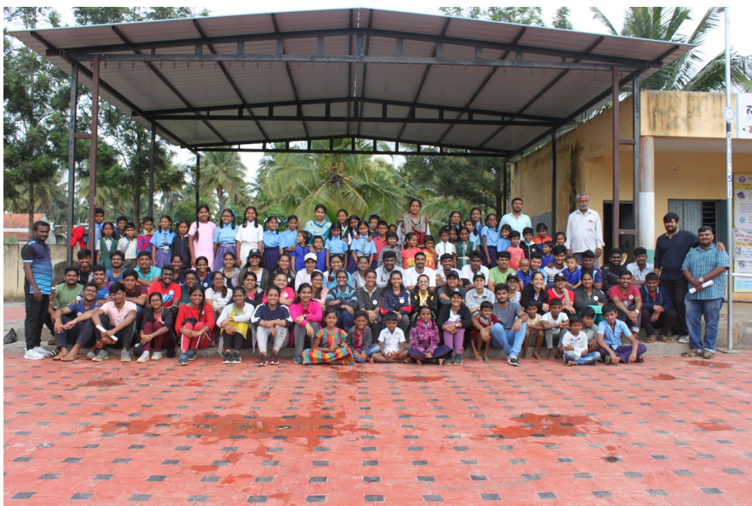
Group photo with School students