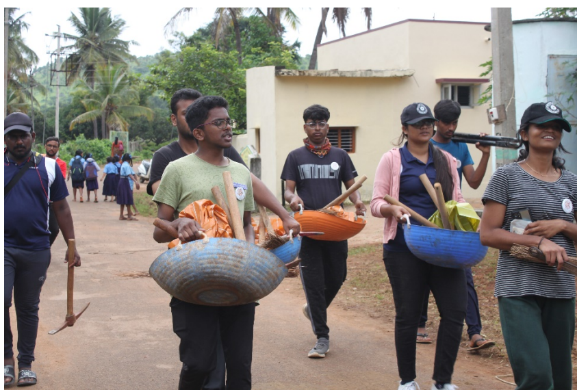
Preparing for Shramadhana