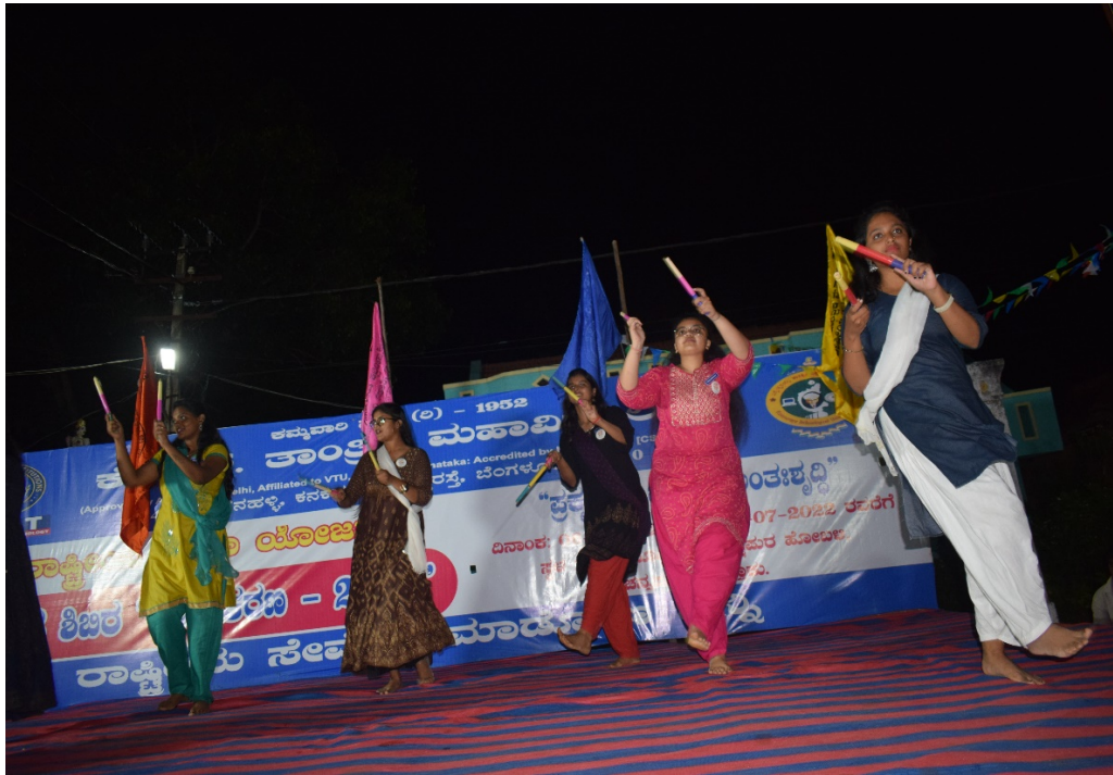
Cultural Performances by NSS volunteers