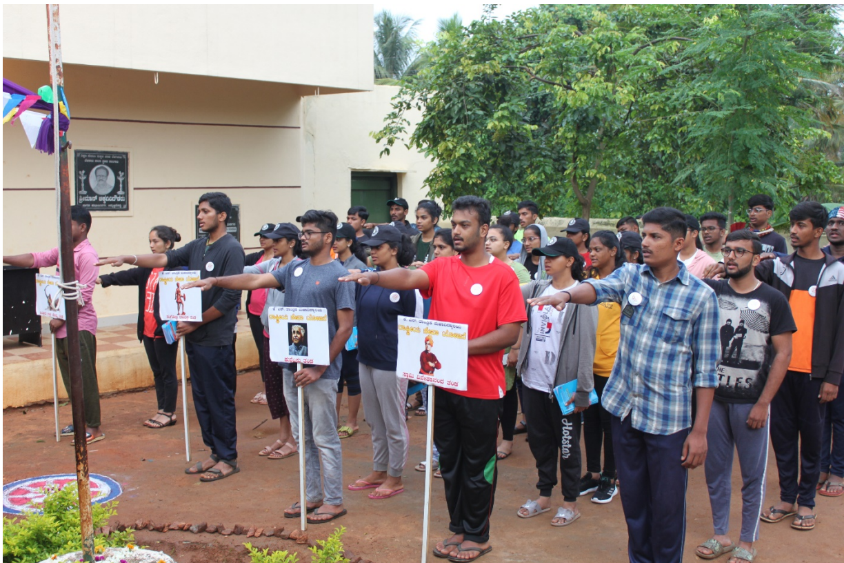
Volunteers taking pledge during flag hoisting