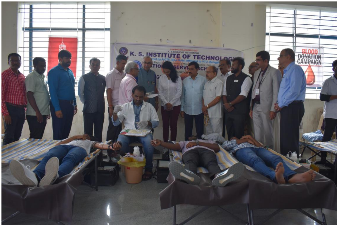
Volunteers Donating Blood