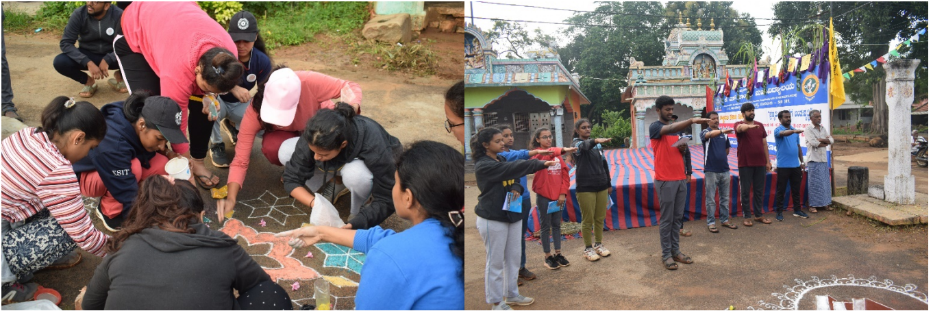
Arrangements for flag hoisting Taking pledge during flag hoisting