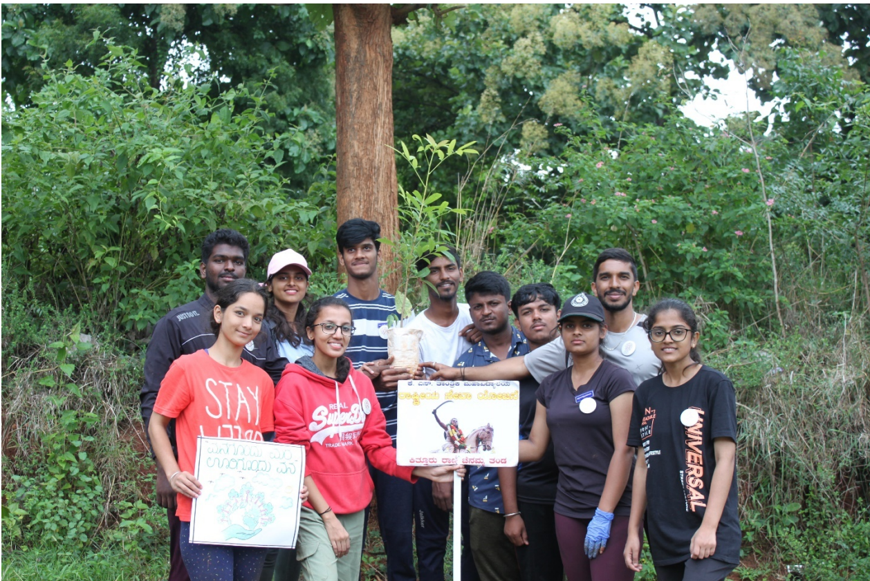
Team Kitturu Rani Chennamma planting the sapling