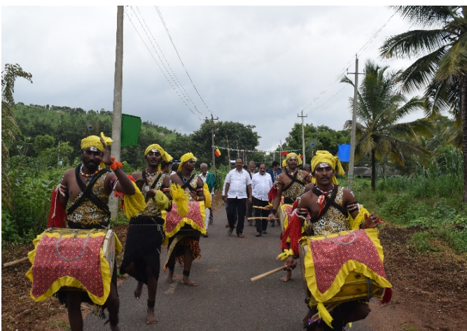
Guests entering the Inaugural function

The program ended by 8:30 pm with a message that "There should be schools and toilets developed in villages that horizontally improves the nation". We had our dinner and the day was winded.