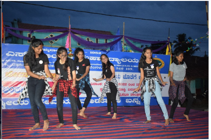
Cultural program by NSS volunteers