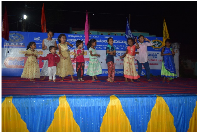
Dance performance by village students