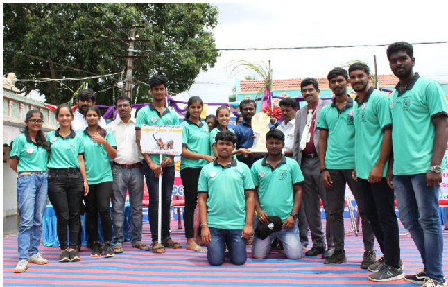
Prize distribution to all the teams