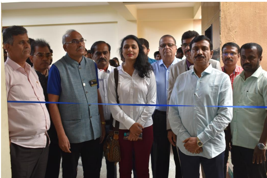
Tape cutting by The Chief Guest