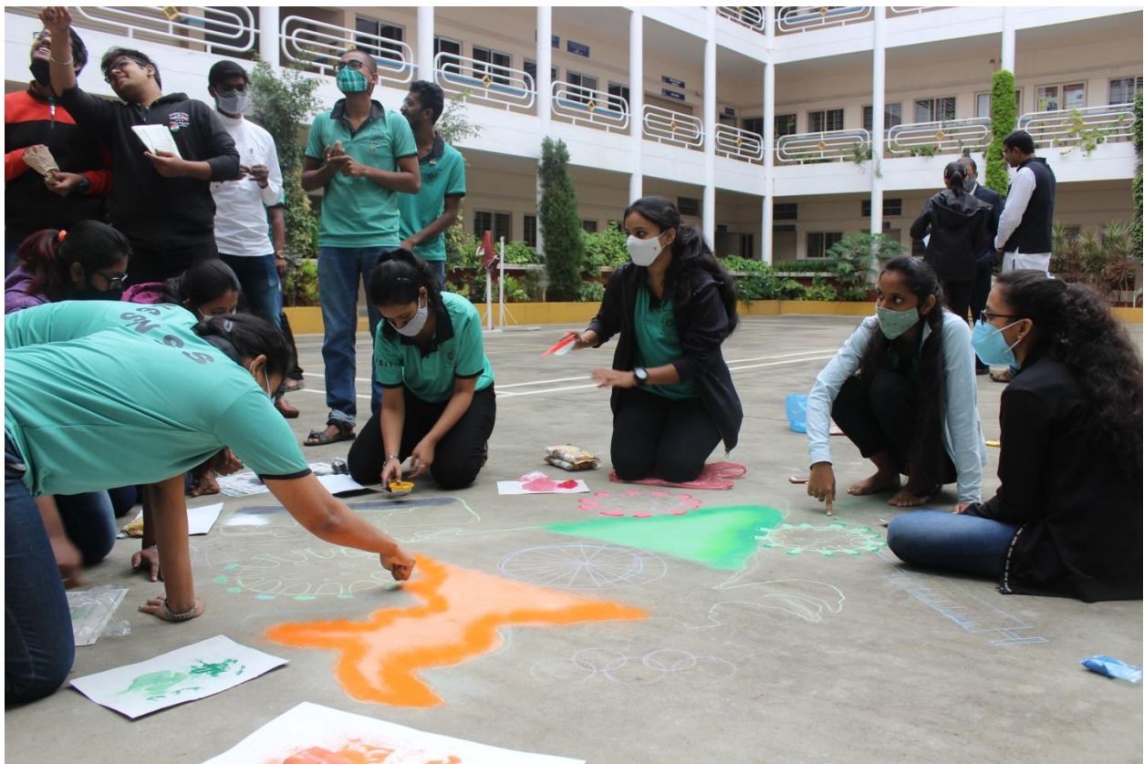
NSS volunteers preparing for Independence Day