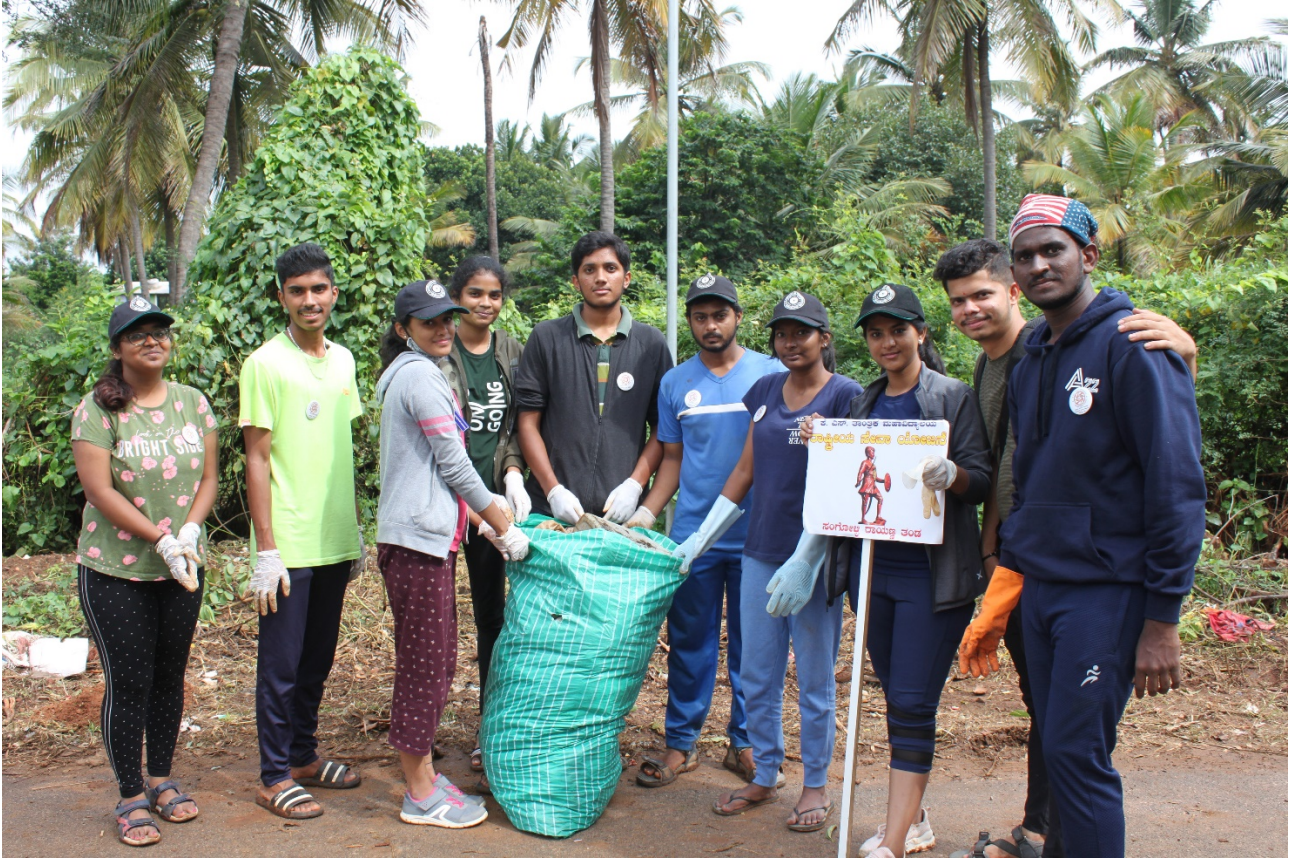
Group photo of team SangolliRayanna