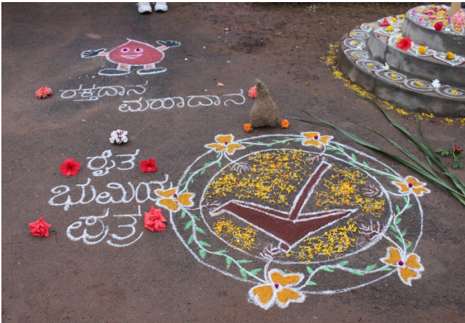
Preparations of flag hoisting

All the NSS volunteers assembled at 5:40am near the flag pole. On this day captains and vicecaptains were not changed and the team responsibilities weren't changed. Chief guests for flag hoisting were Shivanna, Appaji, Sujana(Alumini of KSIT). We all sung NSS song and had the pledge. The theme for flaghoisting was about blood donation as we had blood donation camp on that day. Later we all went to Virupakshipura to distribute pamphlets about health camp that is conducted at Government School the next day. We had our breakfast and later blood camp was conducted. Books were distributed to the students of Government school by the Aluminis of KSIT.DKSuresh, honorable MP of Bangalore Rural arrived as the chief guest for the day and addressed the gathering about NSS and also shared his experience as a NSS volunteer.We had lunch by 3:00pm. Flag dehoisting was done and the guests were Suma and Niveditha who were the aluminis of KSIT. The cultural program started by 7.00pm and guests were Renuka Prasanna from ABCD Dance Academy. The performances were given by ABCD Dance Academy and NSS volunteers. Also village kids participated and enjoyed the program. After the program, the team incharges were changed. We had our dinner and slept around 11:15pm.