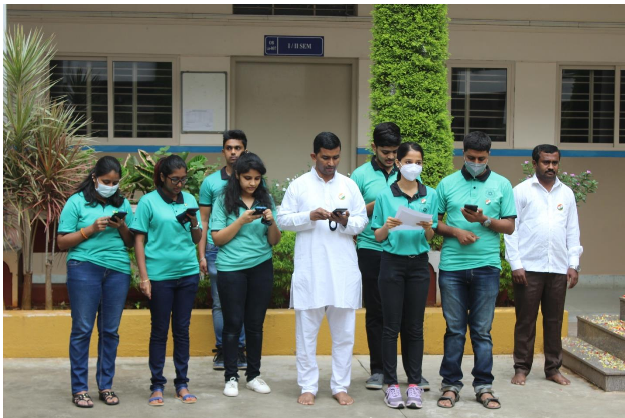
NSS Volunteers singing a group song