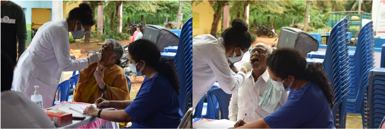
Photos of Dental Camp