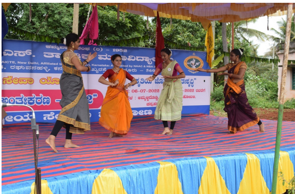
Cultural performance by NSS volunteers