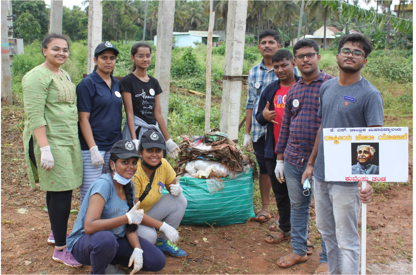
Group photo of team Kuvempu