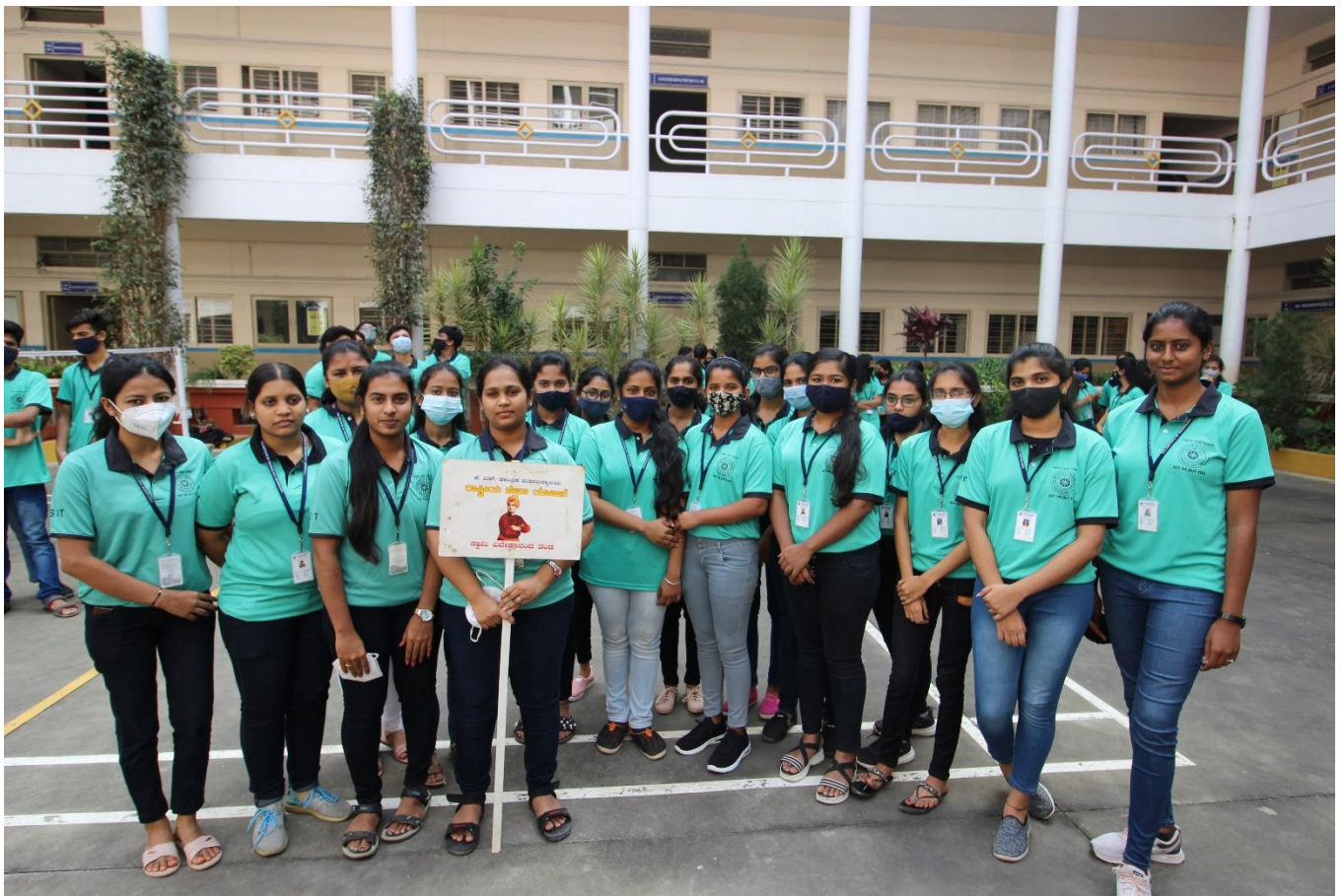
Group photo of team Swami Vivekananda