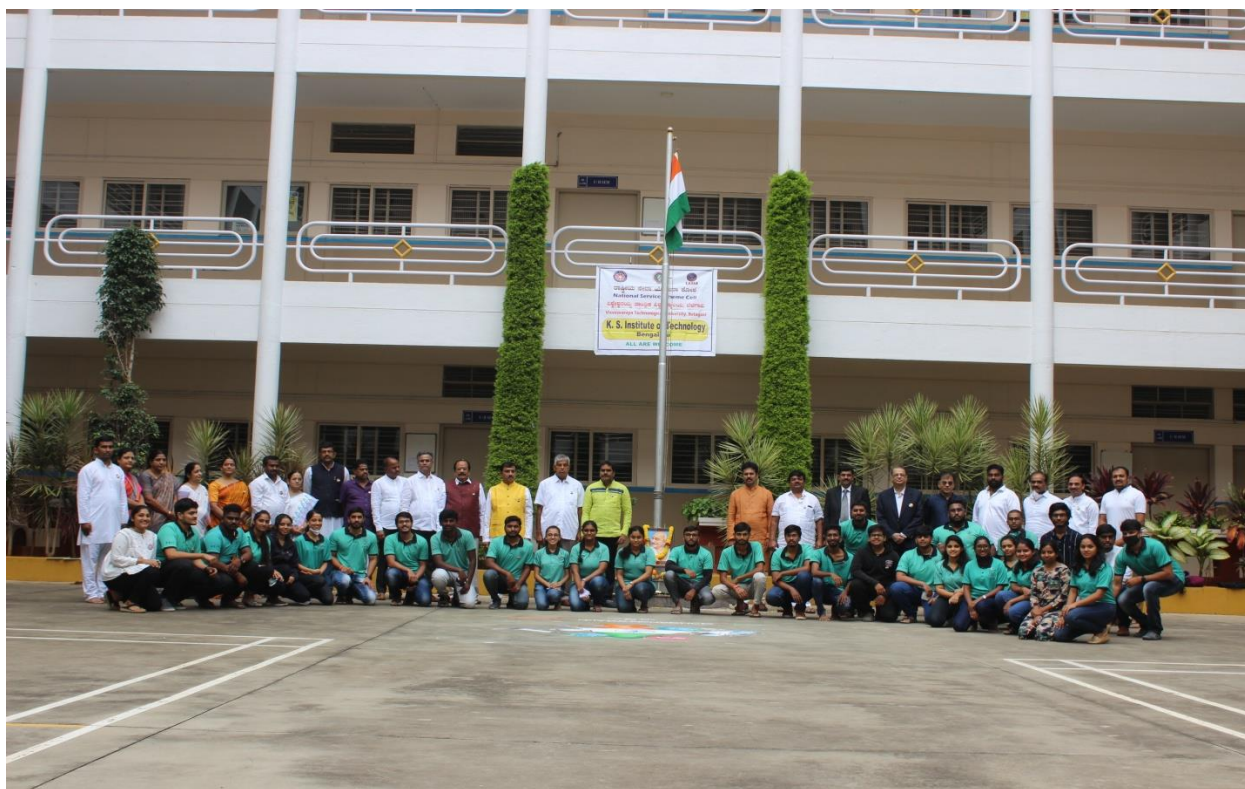
Group photo NSS Volunteer