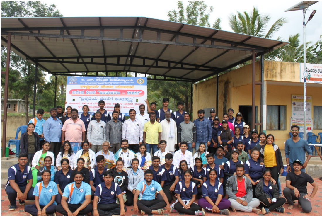
Group photo with doctors