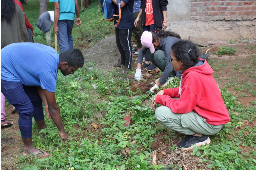
Volunteers cleaning near Samudhaya Bhavana