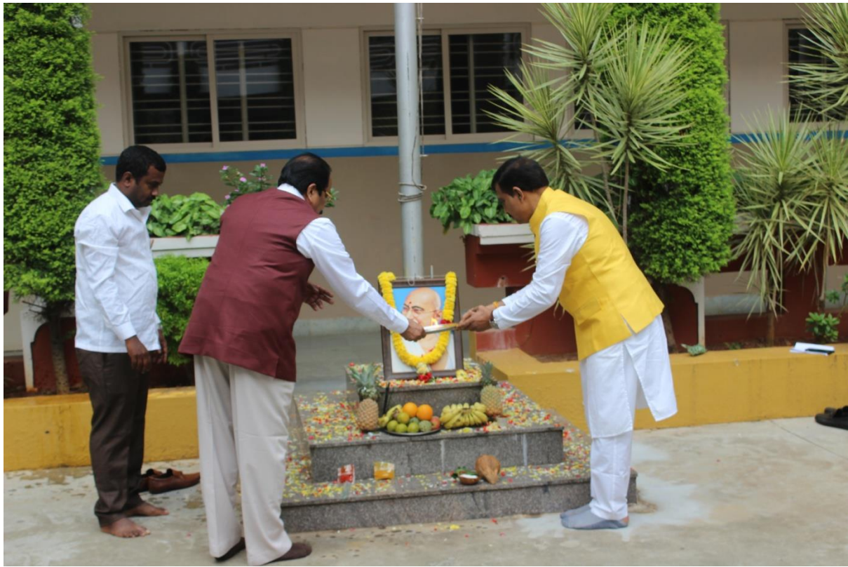
President and secretary performing pooja