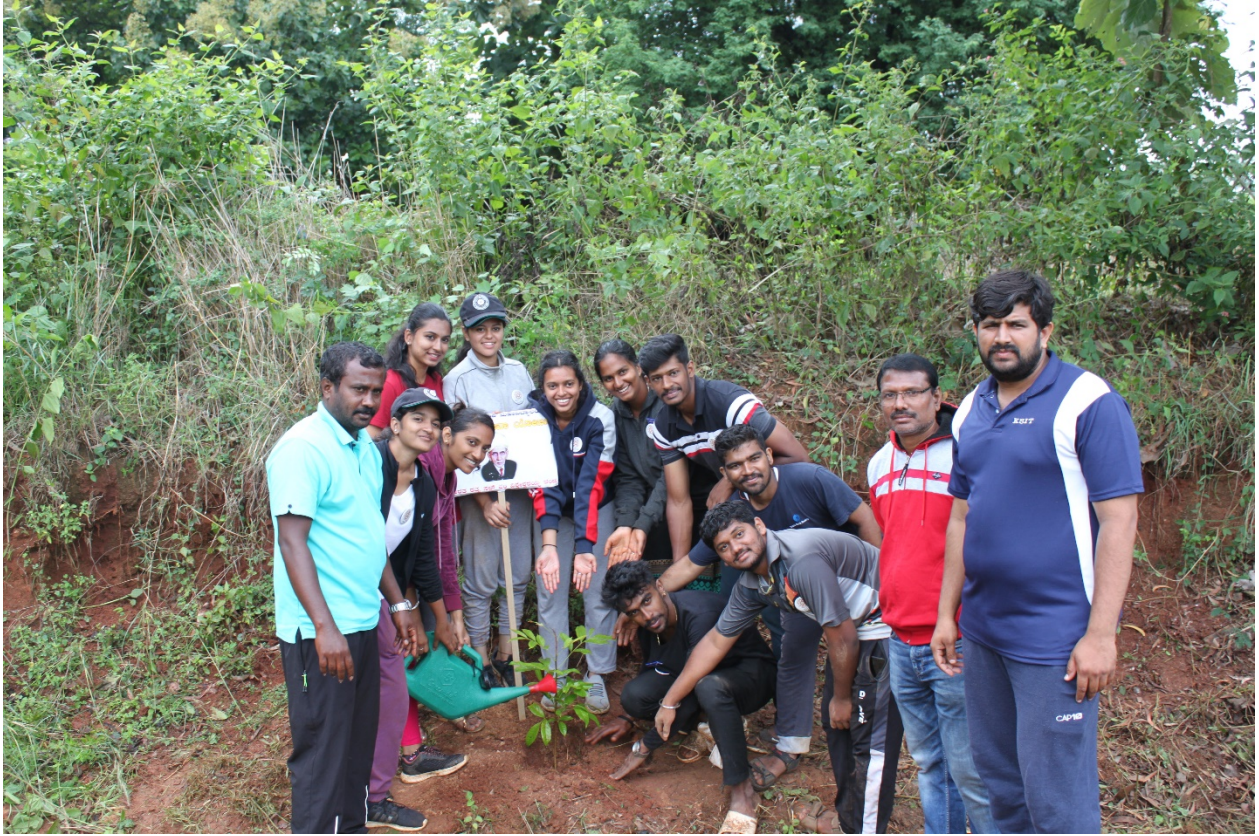
Team Vishveshwaraiah planting the sapling