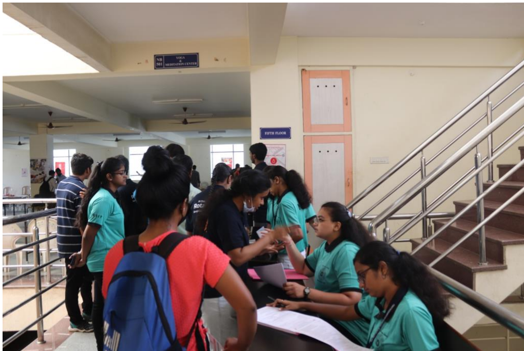
Registration for Blood Donation