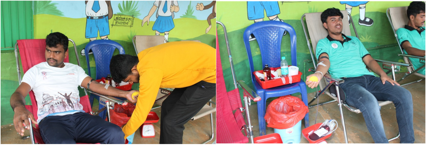
Photos of Blood donation Camp