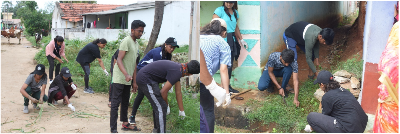
Volunteers cleaning the streets