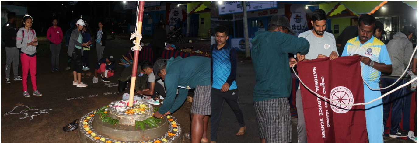
Making arrangements for flag hoisting