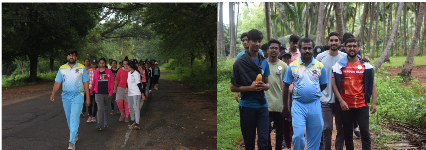
NSS students going for trekking