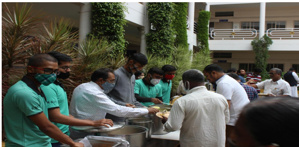
Refreshment in the function