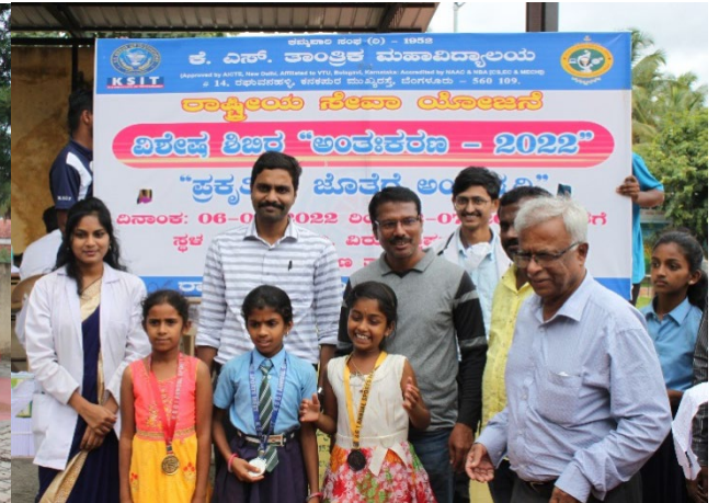
Interaction with school students and prize distribution