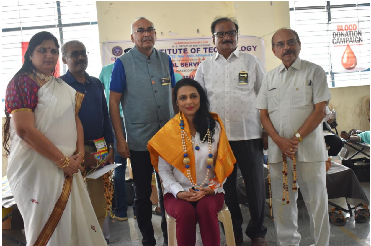
Felicitating and Honoring the Chief Guest