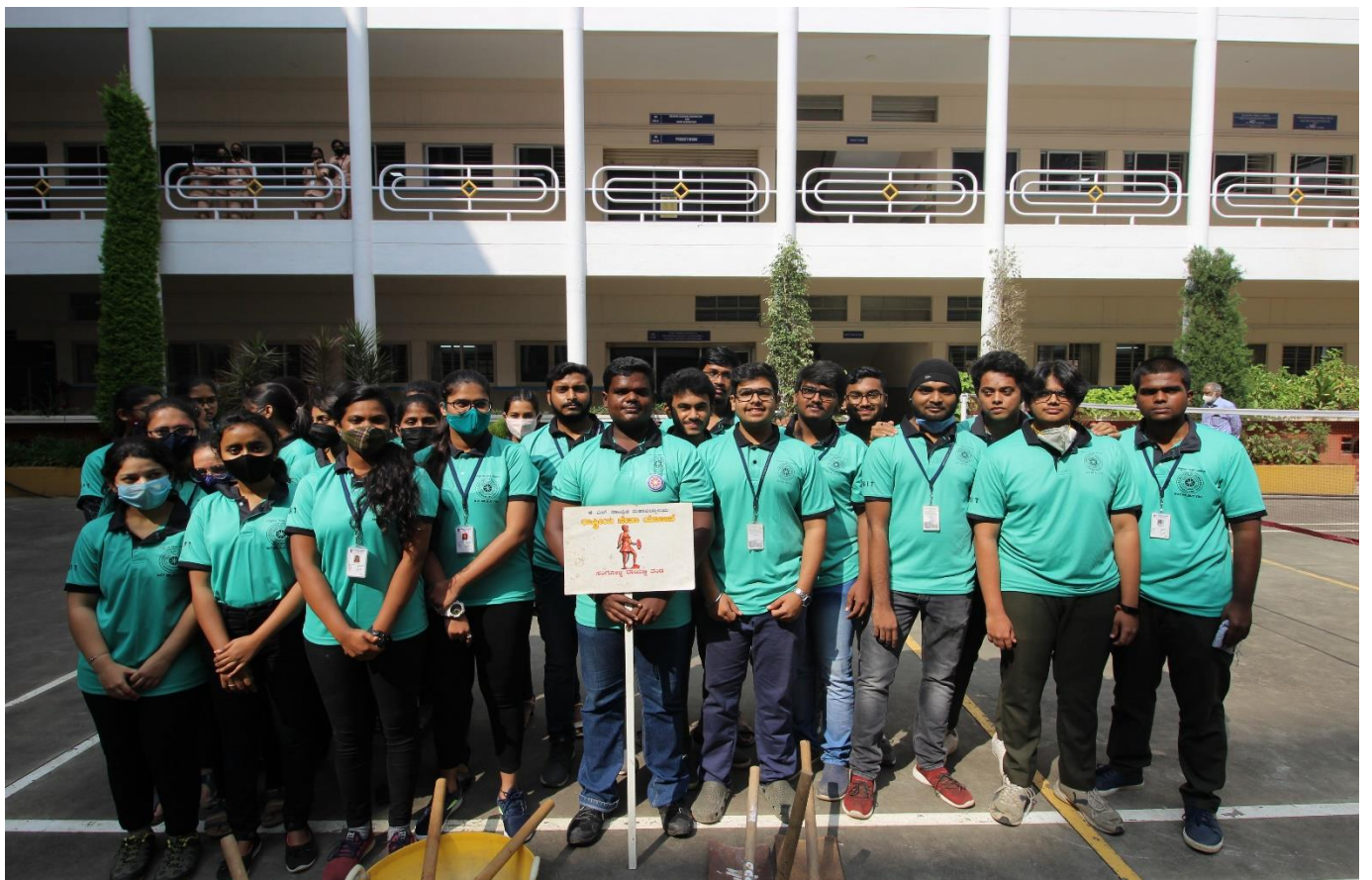
Group photo of team Sangolli Rayanna