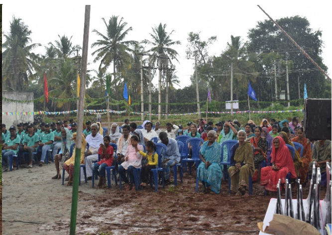
Audience of the Inaugural function