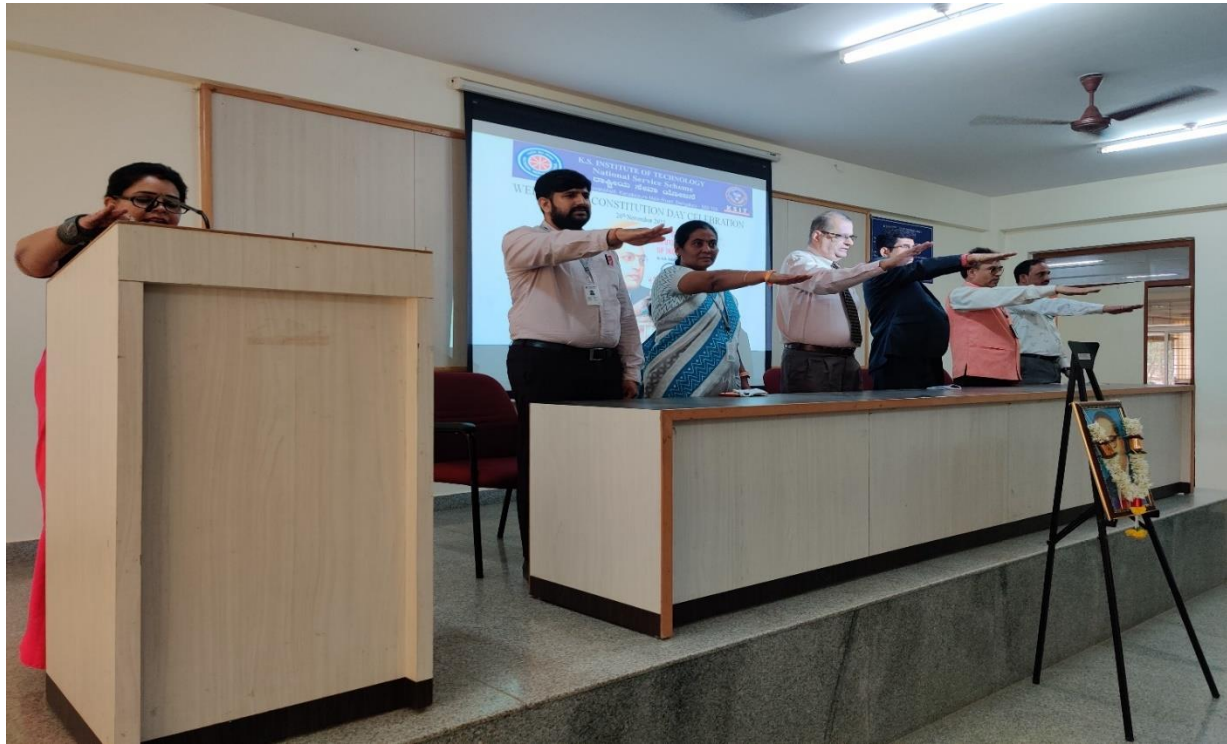
Dignitaries taking the Pledge

gathering regarding the importance of Preamble of Indian Constitution. Later, all the Dignitaries, NSS volunteers and students took the pledge of the preamble of Indian Constitution.