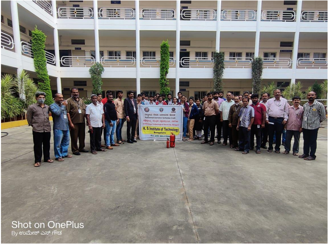
Group Photo of Dignitaries along with the NSS volunteers