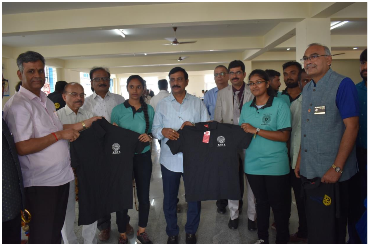
Chief Guest distributing Rotary Club T-Shirts to the Volunteers