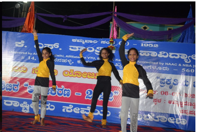
Cultural programs by ABCD dance academy