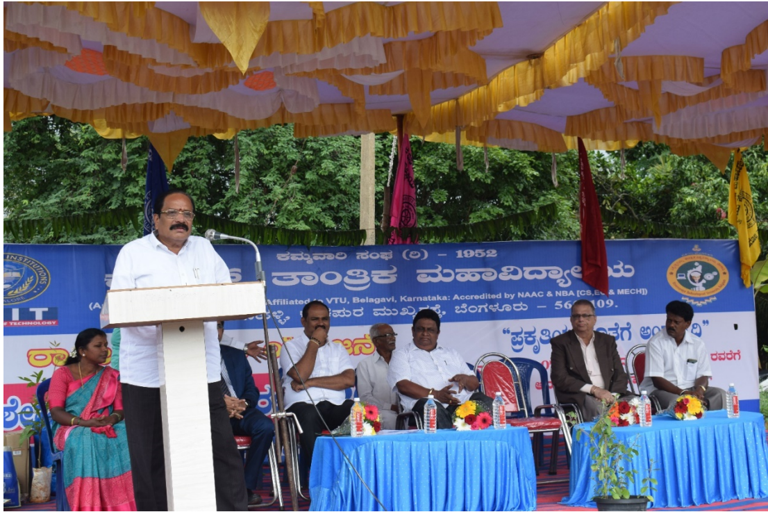
President of KSGI addressing the gathering