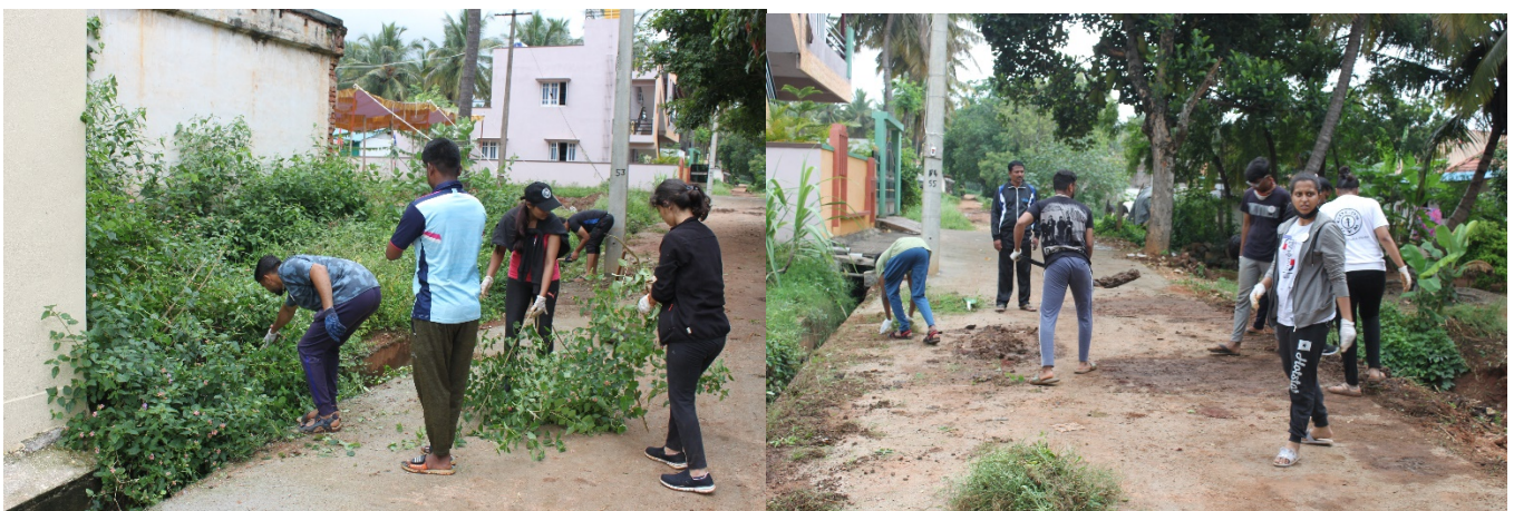
Volunteers cleaning the village streets and drains