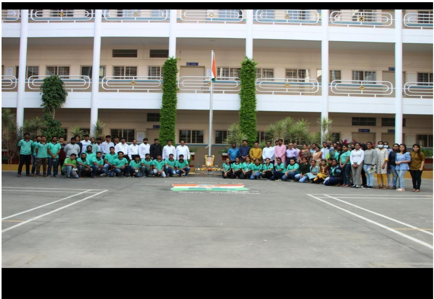
Group photo with the dignitaries and the NSS volunteers