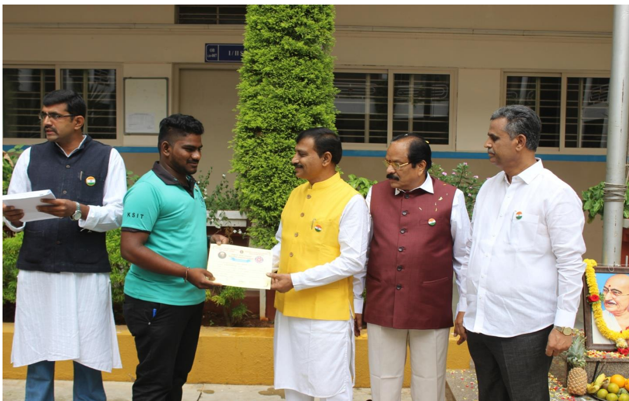
Certificate distribution to NSS volunteers