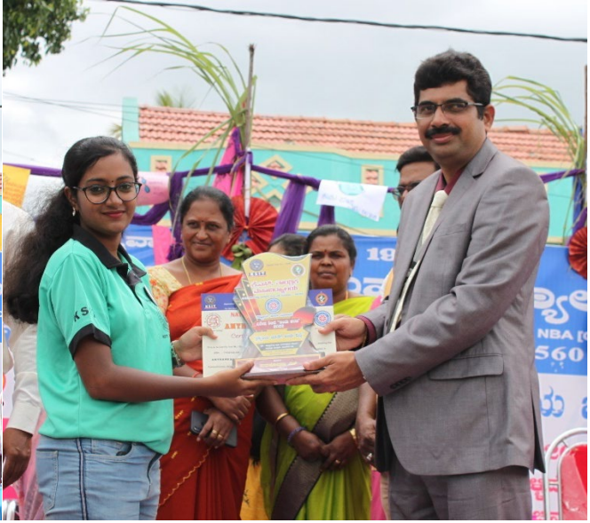
Prize distribution to volunteers