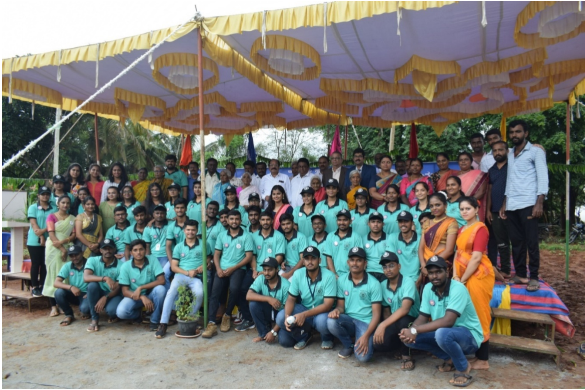
Group photo of NSS volunteers along with the Guests