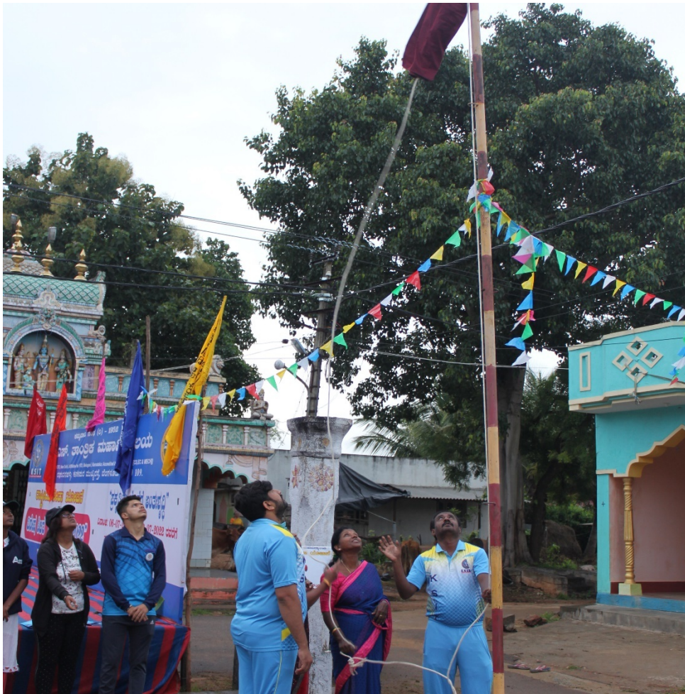
Flag hoisting by the Chief Guests