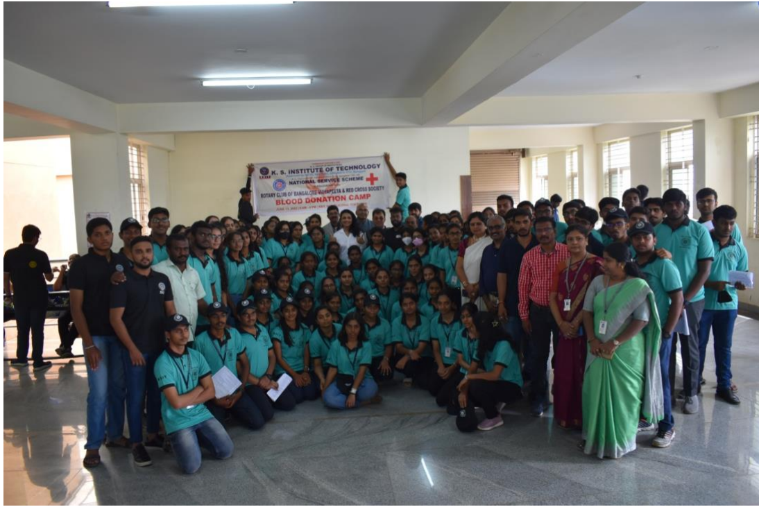
Group Pic with The Chief Guest