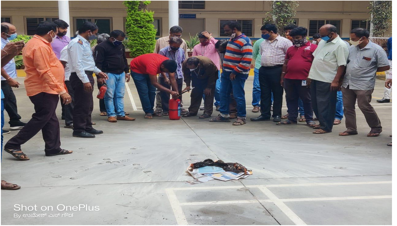
Addressing the usage about the fire extinguisher