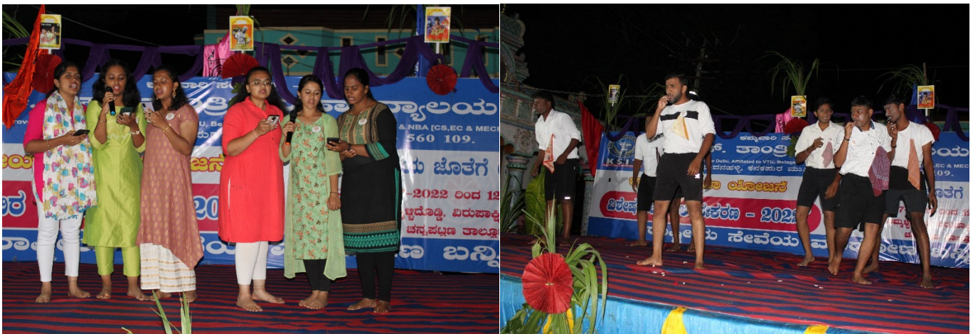
Cultural performances by NSS volunteers