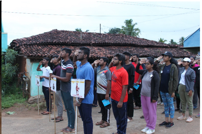
Volunteers assembled during flag hoisting