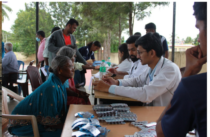
Health check-up for villagers