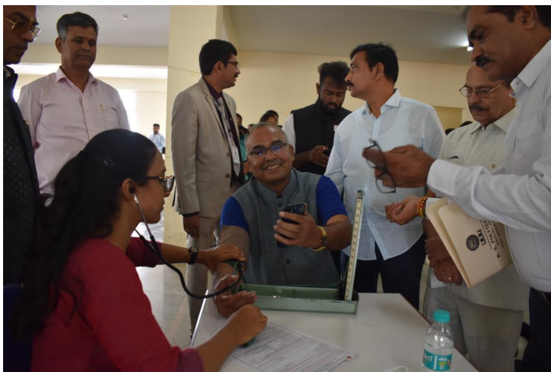
BP Check before the Blood Donation by one of the Guests