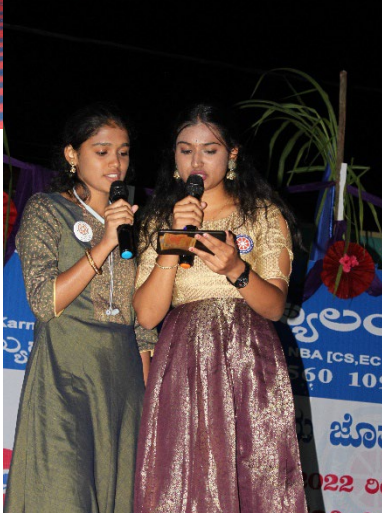
Cultural Performances by NSS Volunteers