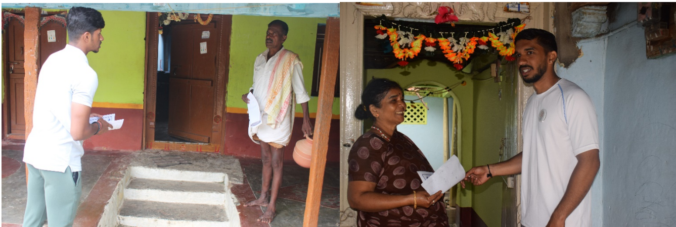
Distributing pamphlets of health check-up