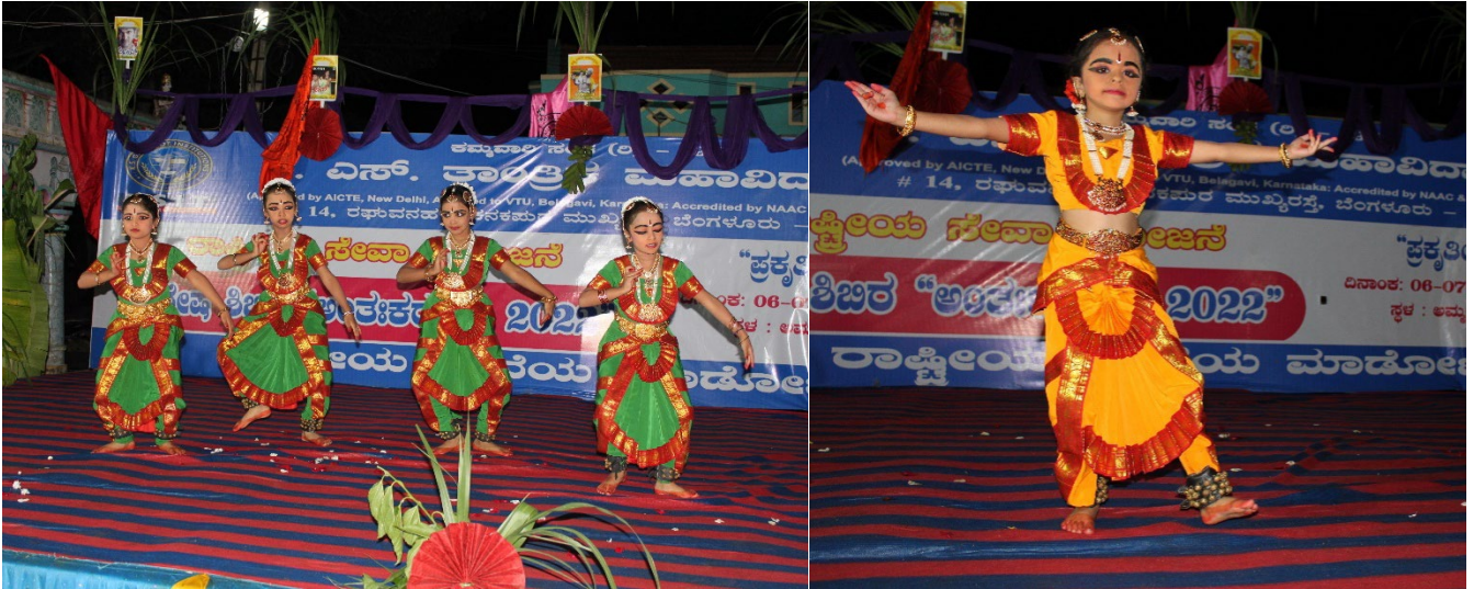
Dance performances by Pushkara performing arts