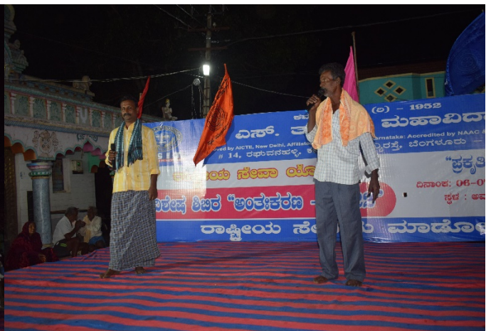
Cultural performances by Villagers