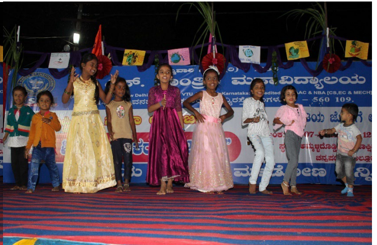
Dance performance by village students