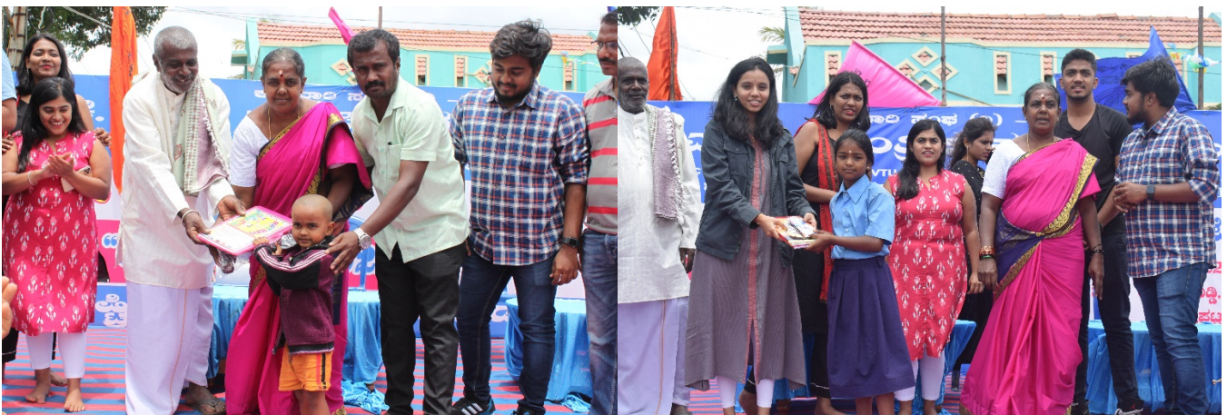
Distributing books and slates to school students