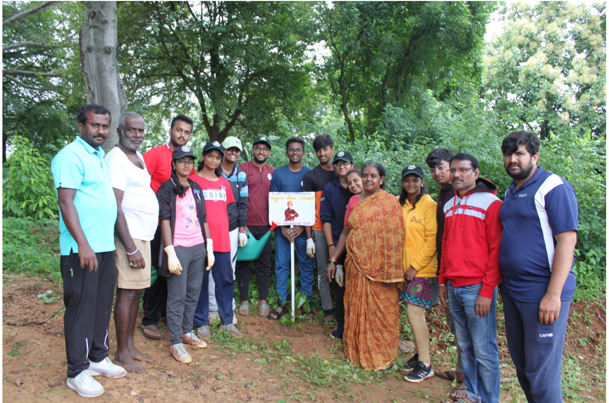
Team Swami Vivekananda planting the sampling