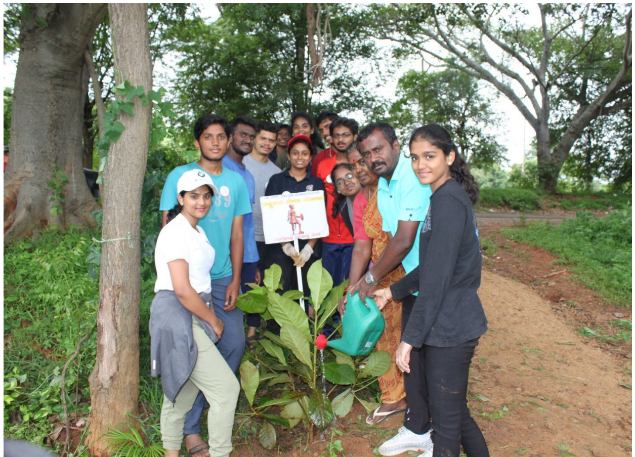
Team SangolliRayanna planting the sampling