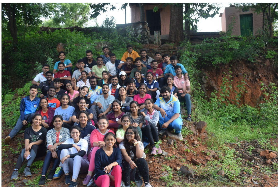
Group photo during trekking