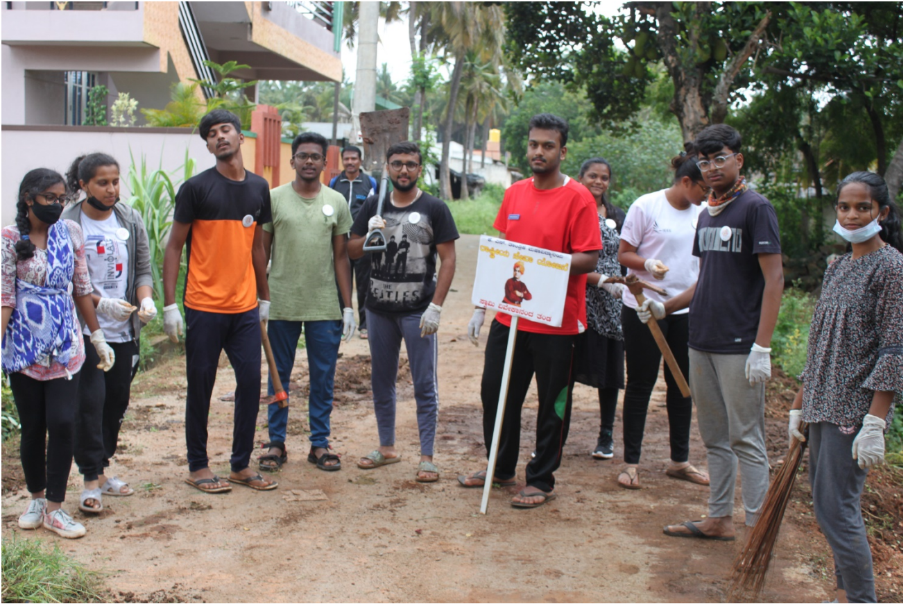
Group photo of team Swami Vivekananda