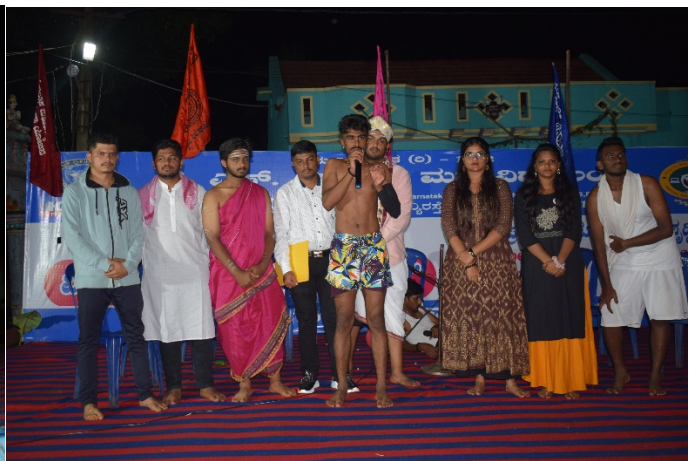
Cultural performances by NSS volunteers