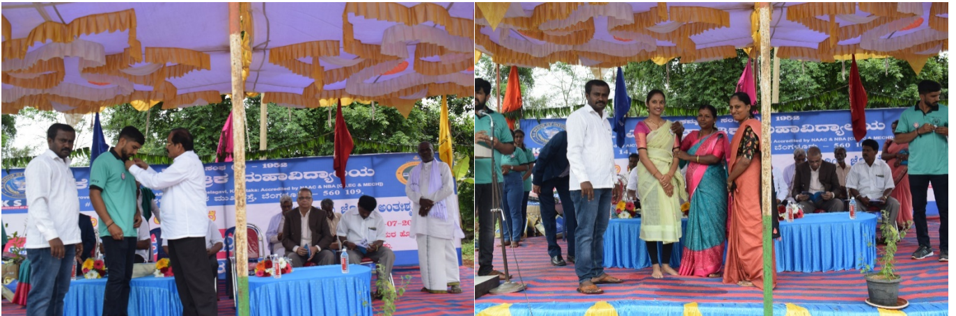
Badge distribution for the Captains of the camp