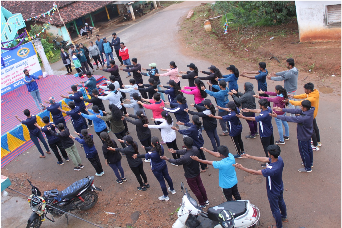
Personality development program