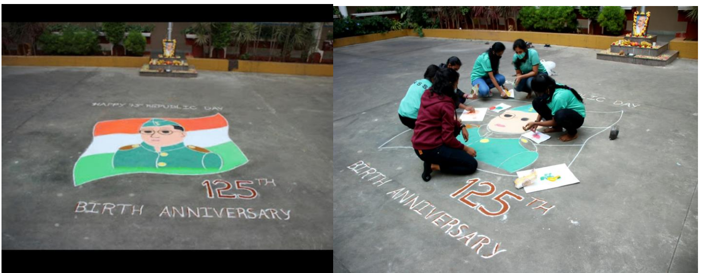
Rangoli by NSS volunteers