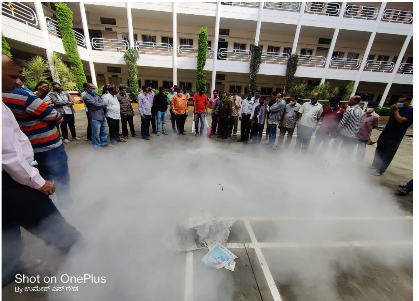
Live Demonstration of the usage of fire extinguisher