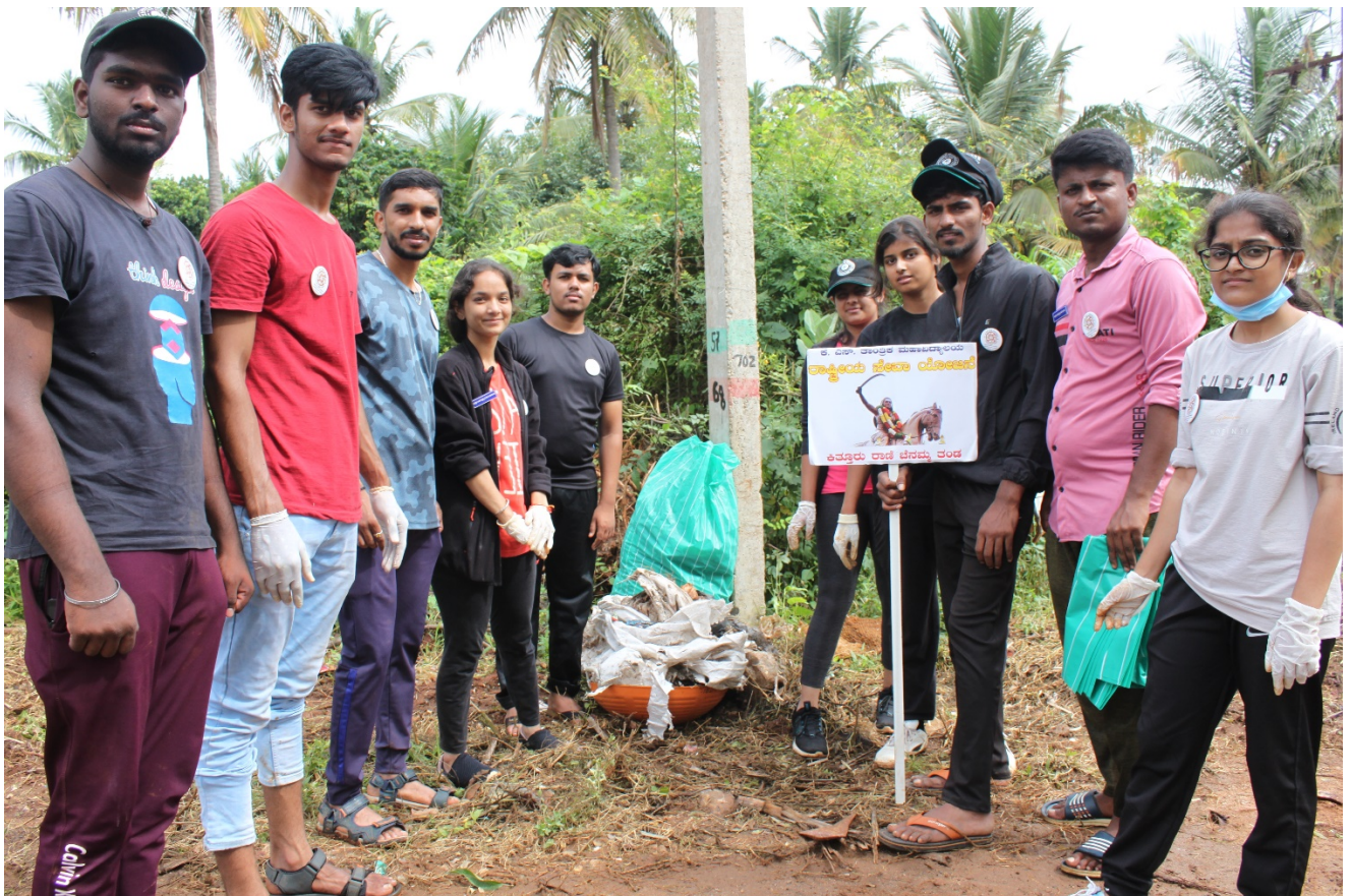
Group photo of team Kitturu Rani Chennamma