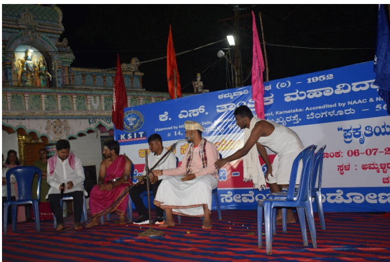
Cultural program by NSS volunteers