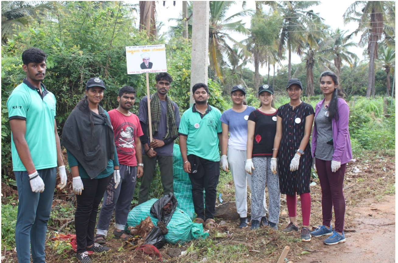
Group photo of team Vishveshwari