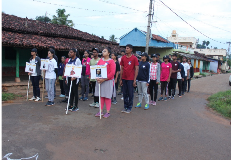
Volunteers assembled for flag hoisting