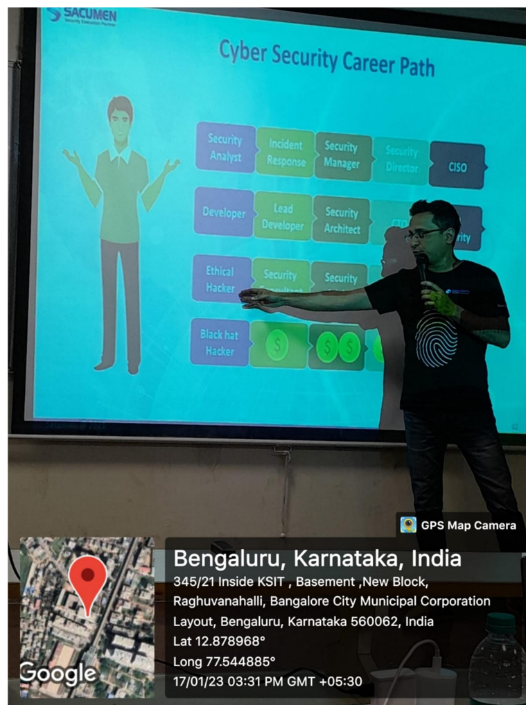
Fig. 3 Mr. Jeevesha outlining the Cyber Security career path

Value- be – keep – do not fall –privacy skeptical civil yourself for updated dist