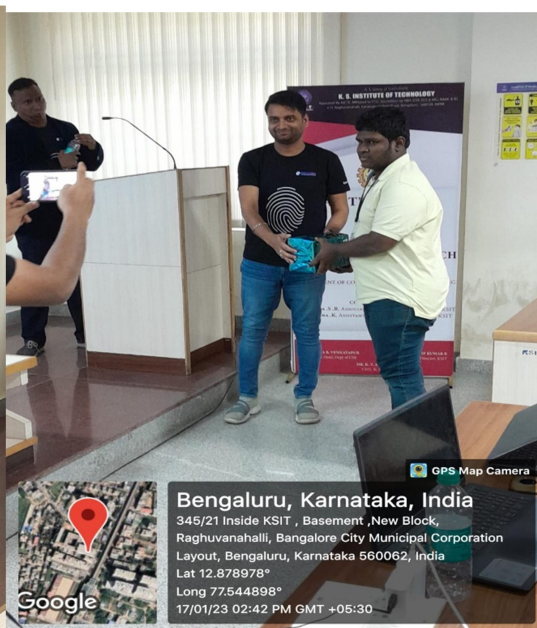
Fig. 6 Students receiving prizes after assessment by the Resource person from Sacumen