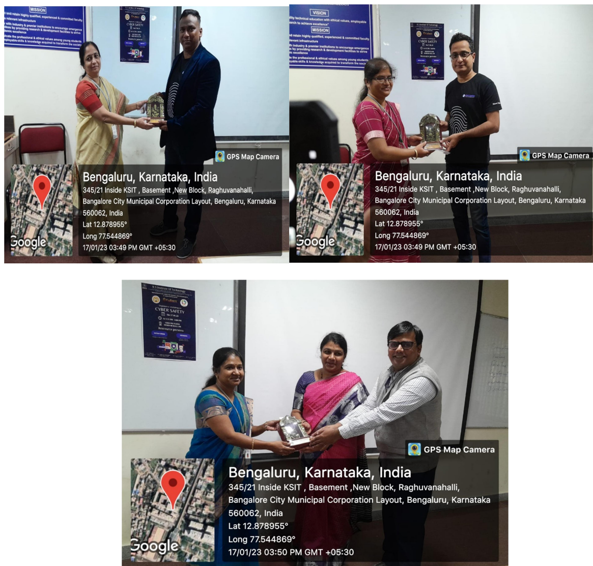
Fig. 7 Handing over mementoes to the resource persons