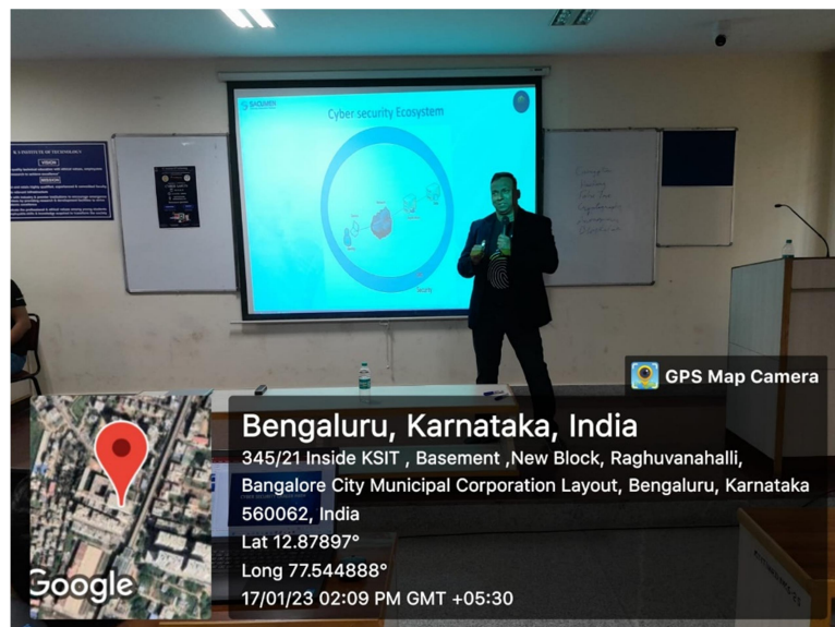
Fig 2 Mr. Nitesh Sinha explaining Cyber Security ecosystem

The Session started with an explanation of Cyber Security.