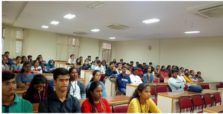
Fig. 5 Students attending the workshop