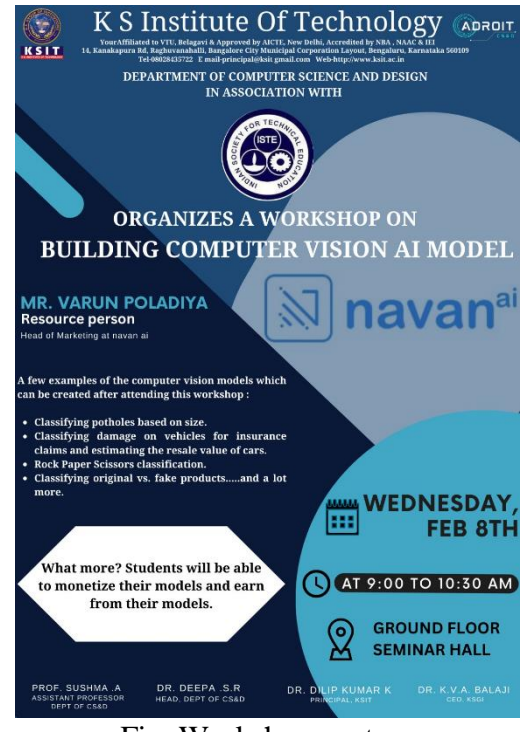
Fig. Workshop poster