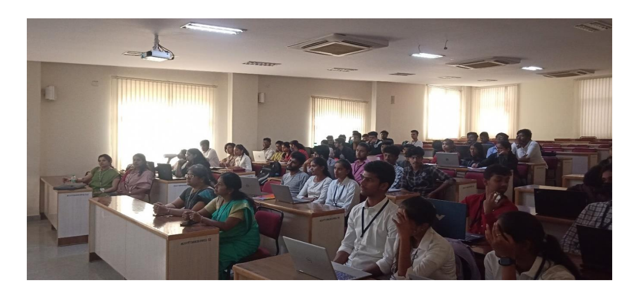
Fig. Students attending the session

The students were further given a hands-on experience of how to create models on computer vision. Each student was made to work on their laptop and create a computer vision model and test it. The students were first made to download a data set which they would use in their model. They were then instructed to use the EfficientNet B0 for Image Classification. They then uploaded about 100 images in each class and renamed their classes based on their data set.