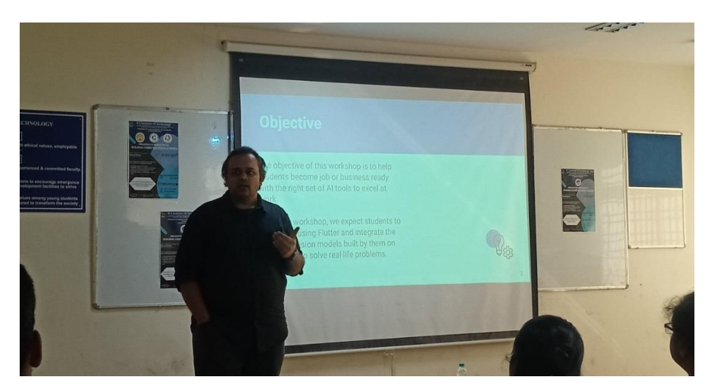
Fig. Workshop Session

The workshop began with the resource person introducing us t,o what Artificial intelligence is and what Computer vision is. the theory and development of computer systems able to perform tasks normally requiring human intelligence, such as visual perception, speech recognition, decision-making, and translation between languages. Computer vision is a field of artificial intelligence (AI) enabling computers to derive information from images, videos and other inputs— and take actions or make recommendations based on that information