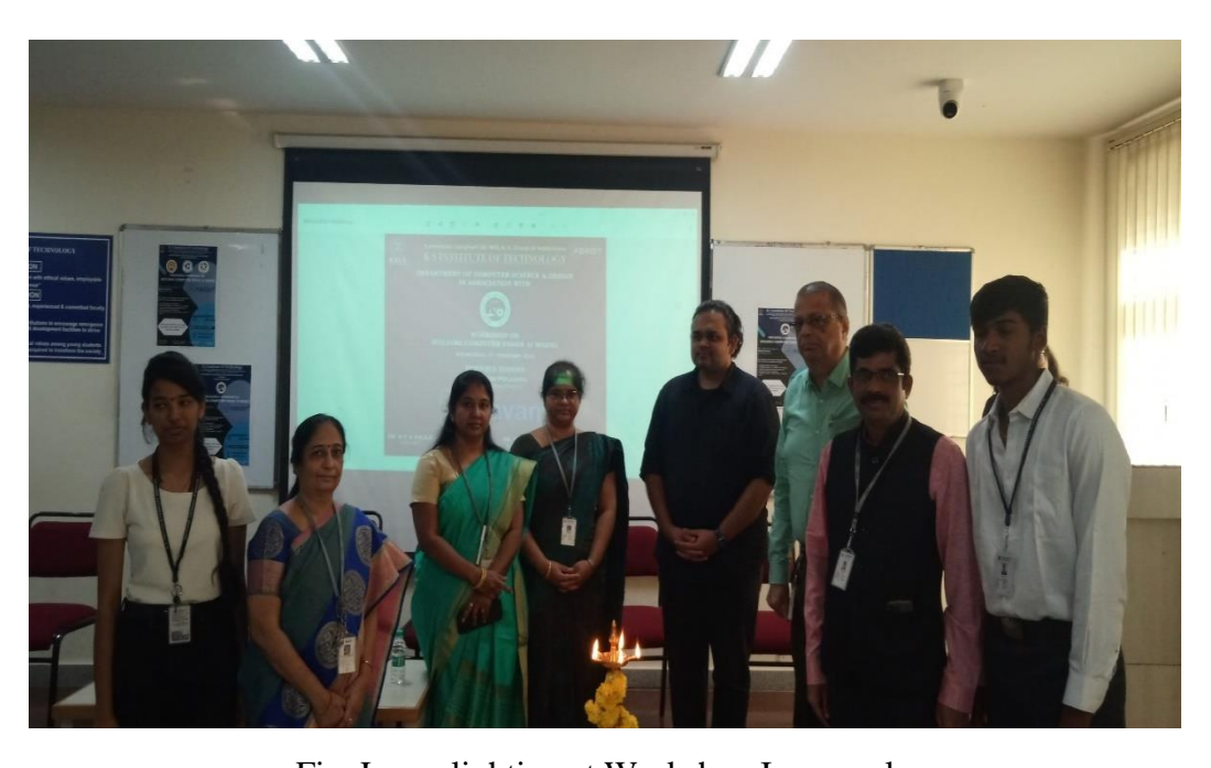
Fig. Lamp lighting at Workshop Inaugural