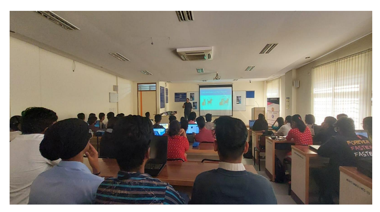
Fig. Resource person addressing students

The students were further given a hands-on experience of how to create models on computer vision. Each student was made to work on their laptop and create a computer vision model and test it. The students were first made to download a data set which they would use in their model. They were then instructed to use the EfficientNet B0 for Image Classification. They then uploaded about 100 images in each class and renamed their classes based on their data set.