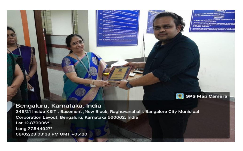
Fig. Presenting Memento to Resource person

Speaker concluded the session by giving an insight in to the career options in the field of new ideas with AI and Computer Vision. This workshop was on opportunity for all the students to come together as a community to learn, share and explore new ideas with AI and Computer Vision.