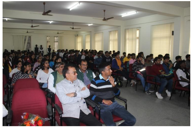
Fig 9: Participants and Faculty during Inaugural function