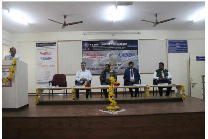
Fig 4: Photograph of Inaugural function