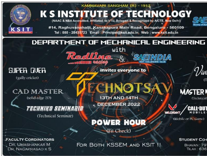
Fig 1: POSTER of TECHNOTSAV 2K22