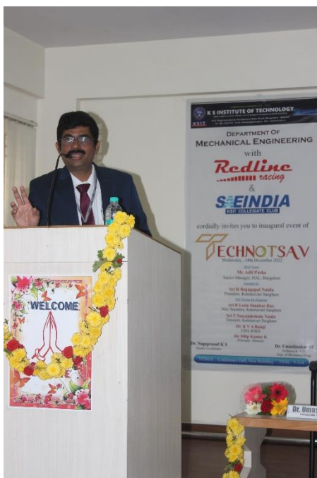
Fig 5: Photograph of Principal sir addressing the gathering