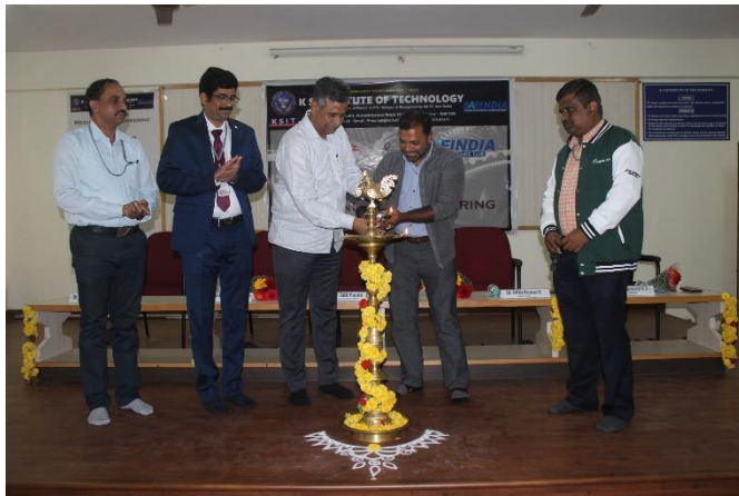
Fig 8: Lighting of Lamp by Dignitaries