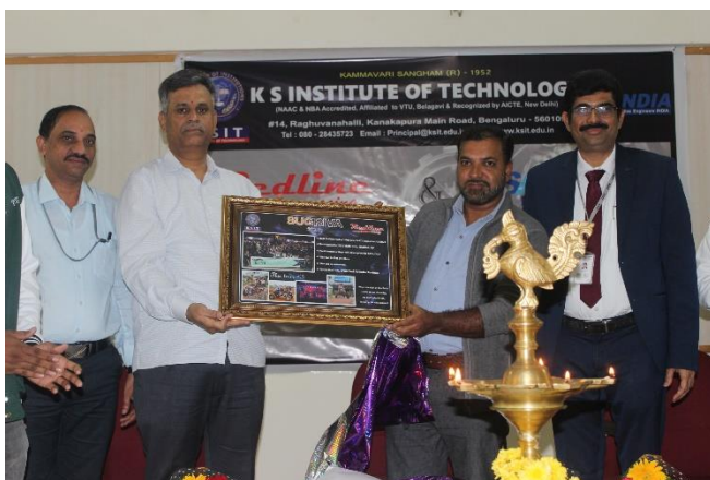
Fig 10: Release of Golden frame of 'Sugriva' ATV