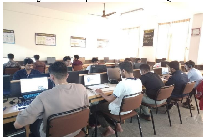
Fig 13: Participants in Mobile gaming