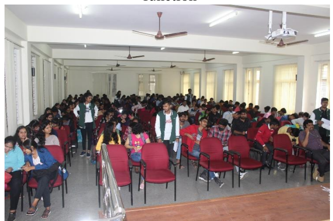
Fig 11: Participants in Technical Quiz