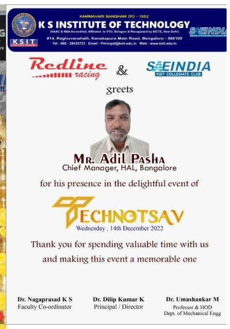
Fig 7: Memento for Chief Guest