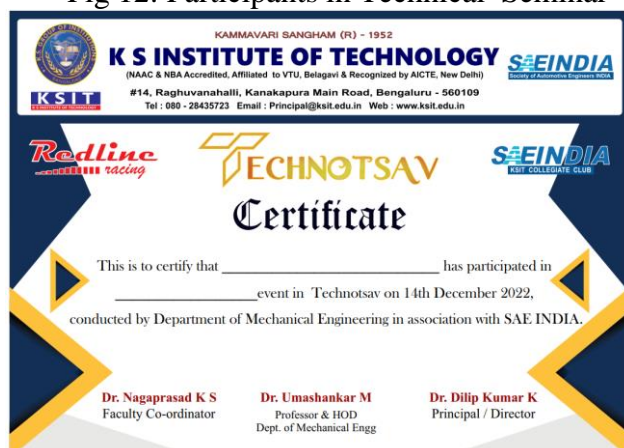
Fig 14: Photograph of Sample 'Participation Certificate'