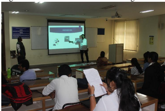
Fig 12: Participants in Technical Seminar