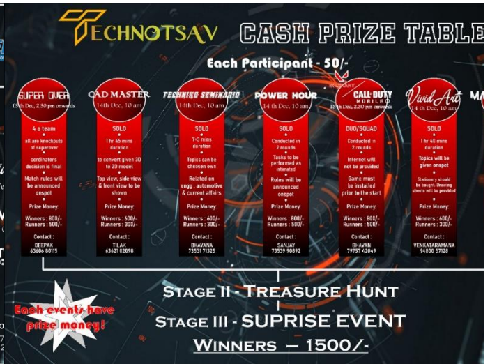
Fig 2: POSTER of ALL THE EVENTS