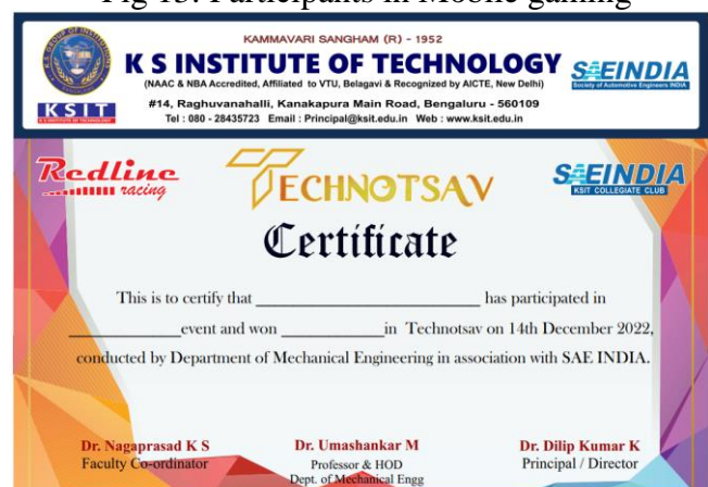
Fig 15: Photograph of Sample 'Winner Certificate'