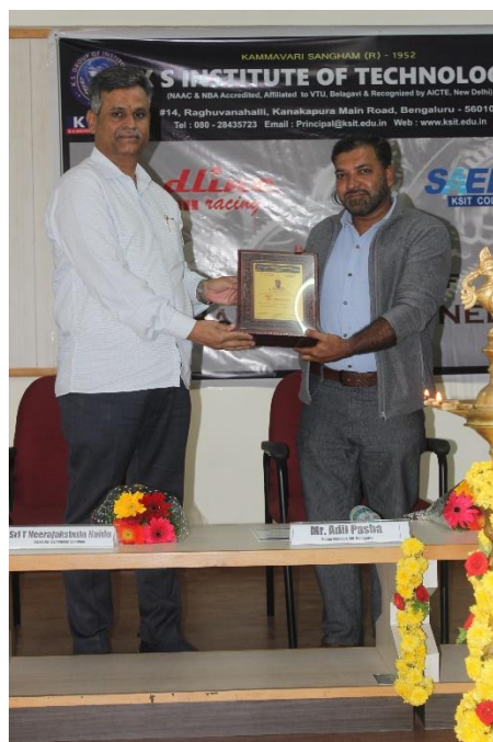
Fig 6: Photograph of Felicitation to Chief Guest