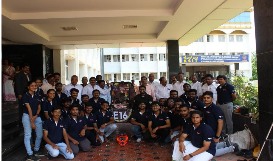
Photograph 2: Team with Prime Sponsors of Respected Management Committee