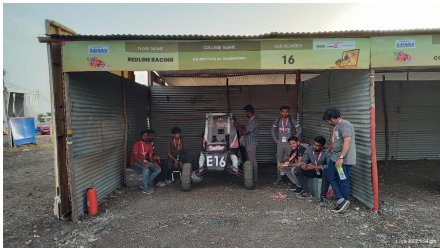
Photograph 4: E- 16 in PIT SHOP at Pithampur, Indore