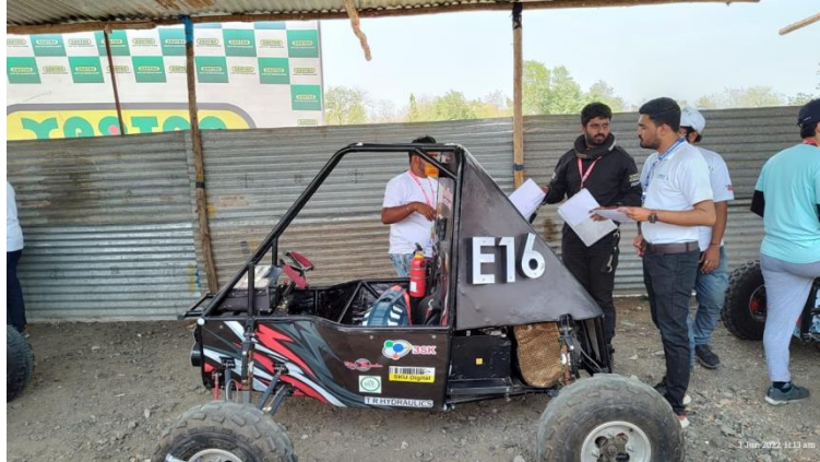
Photograph 5: E- 16 clearing TECHNICAL INSPECTION-Electrical