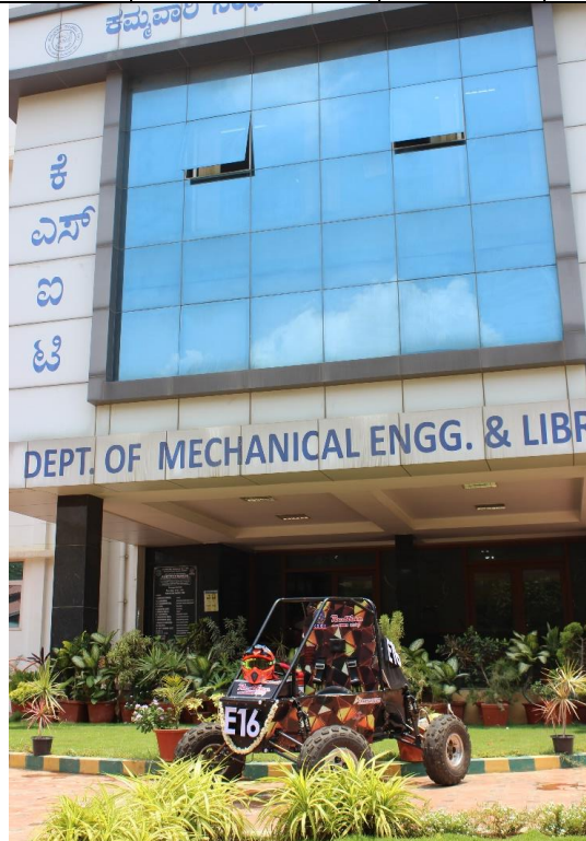
Photograph 1: Vehicle ready to compete