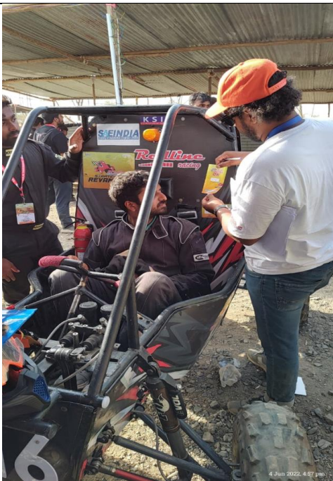
Photograph 6: Proud moment for getting OK Sticker from 'Mechanical Inspection Judge'