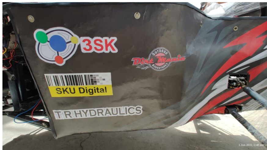
Photograph 3: Sponserers Logo on E- 16