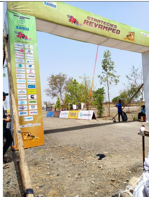
Photograph 7: Passion on automotive: e-BAJA 2022 entrance at Pithampur

The team participated in events viz; Validation, CAE, Virtual dynamics, ALL static events, faculty advisor event. Cleared both Electrical Inspection and Mechanical Inspection successfully.