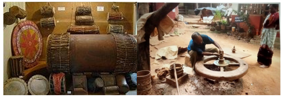
Heritage Gallery and Activity