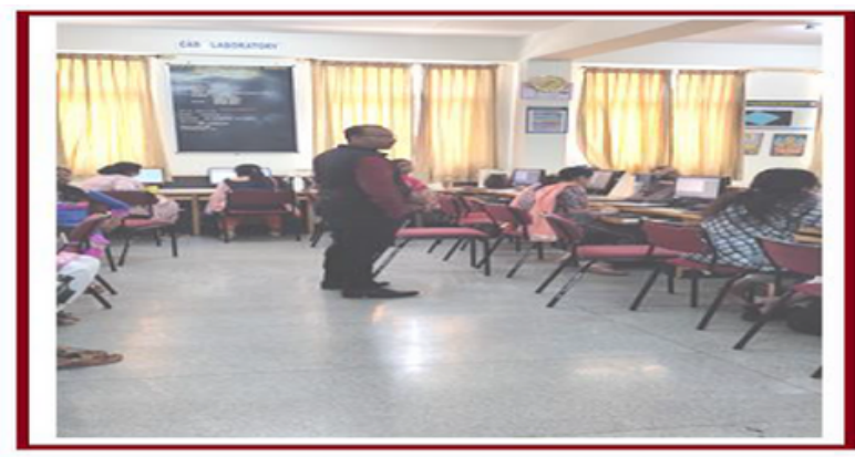
Faculty Development Program on R Programming and its applications