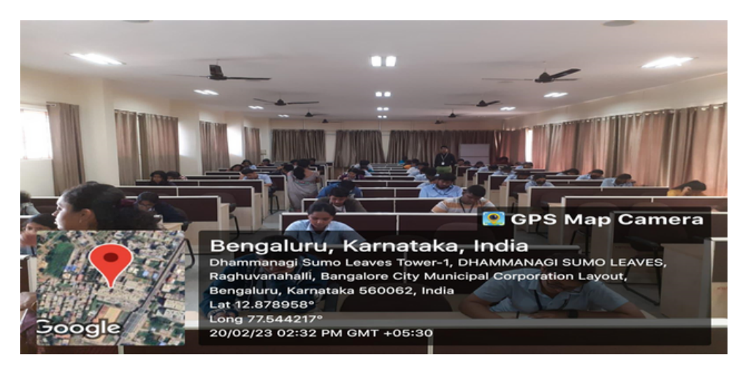
Technical Quiz for College level

• Technical Quiz for College level 14th Edition of Engineering It Quiz – "TCS TechBytes 2023" was conducted in association with BITES on 20th February 2023.