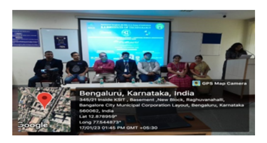
Workshop on CYBER SAFETY