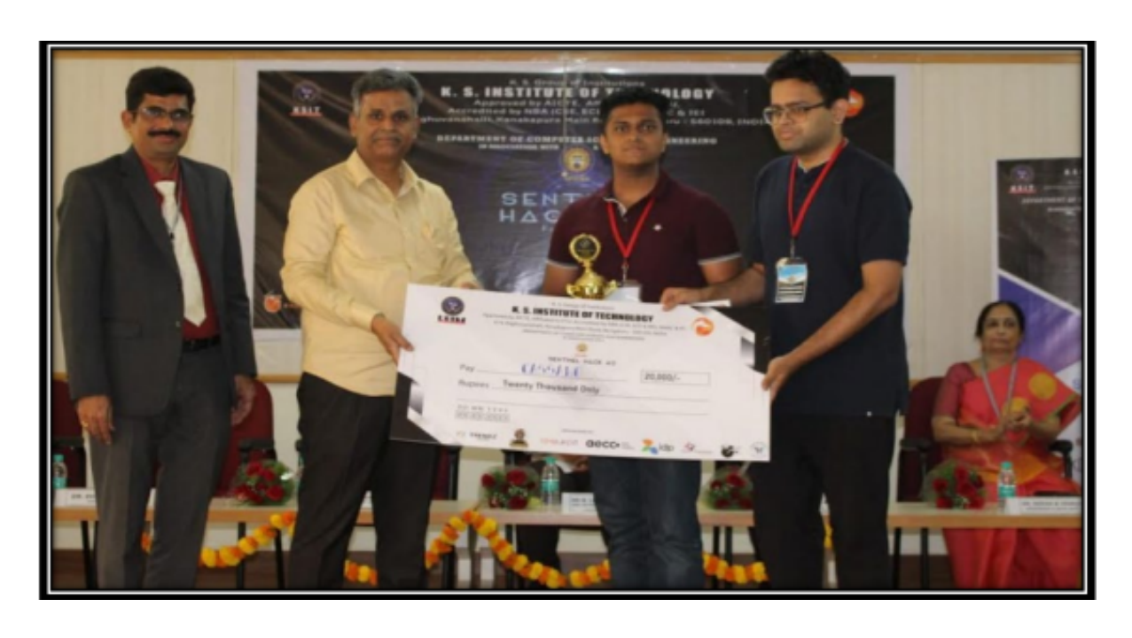
1st Runner-up: Team CASSANO from BNMIT, Bengaluru, won a cash prize of Rs. 20,000 and Trophy